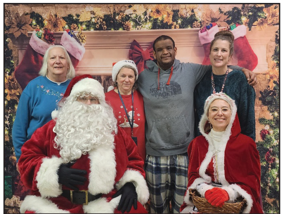
In the days before his big trip around the world, Santa and Mrs. Claus stopped by Holy Family Academy in Hazleton to express their gratitude to the cafeteria team for the great service and dedication they provide to the HFA students and faculty.