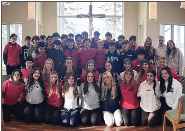
The second Agape Retreat recently concluded for half of the Class of 2026 from Holy Redeemer High School in Wilkes-Barre . The soon-to-be graduates are left with a challenge, which is to go forth to love and dignify all they encounter, and this call to action is already being demonstrated by this remarkable group of students.