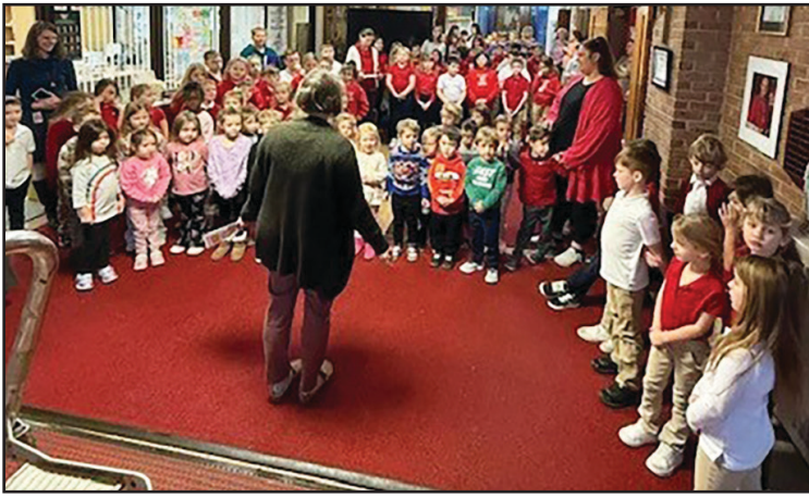
On the Feast of the Epiphany, students and teachers at Saint Agnes School in Towanda gather to bless the doors of their school and classrooms and to pray for God's blessings on all in 2026.