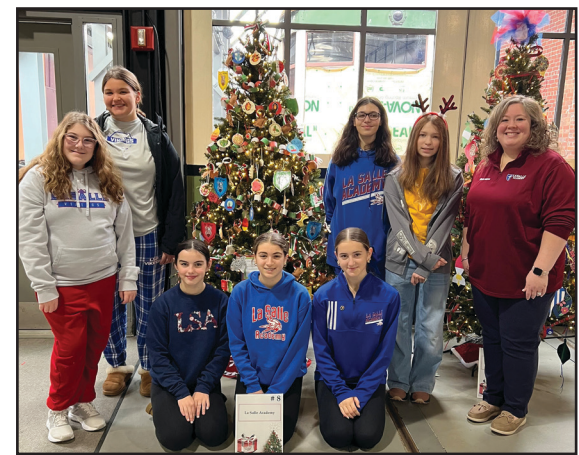
The Viking Council from La Salle Academy in Jessup decorated a tree at the trolley museum to display their school heritage and a variety of Christmas traditions from around the world—it was so fantastic, it won first place!