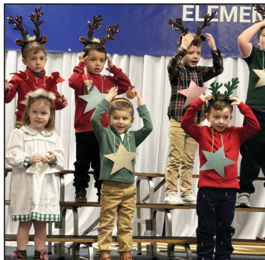
What cuties! Pre-kindergarten and kindergarten students at Saint Mary of Mount Carmel School in Dunmore danced and sang for family and friends at the school's annual Christmas concert.