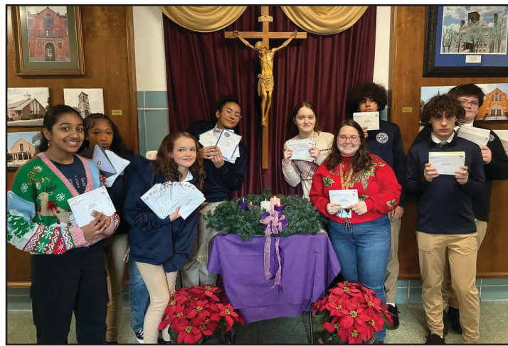
Middle school students from Saint John Neumann Jr./Sr. High School in Williamsport wrote Christmas letters for homebound neighbors in the Williamsport area to help spread Christmas cheer.