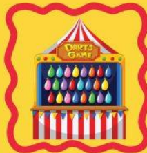
Games ~ Prizes