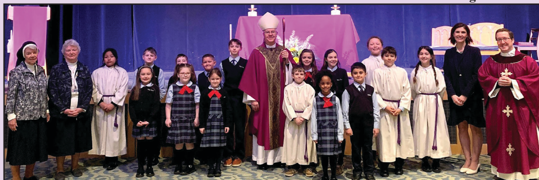
Notre Dame Elementary School, East Stroudsburg