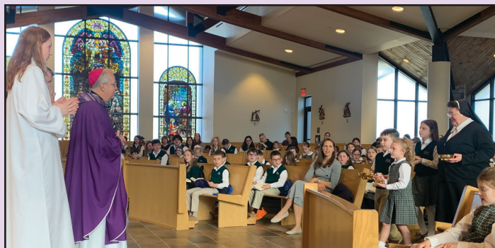
Saint Jude School, Mountain Top