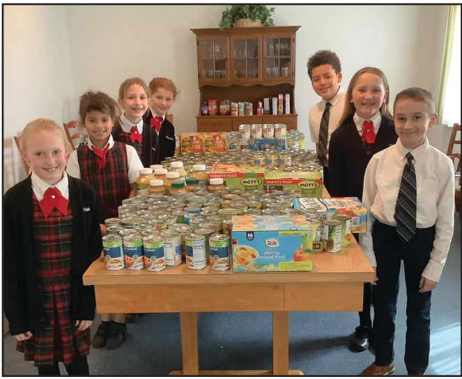
Each year, students at Epiphany School in Sayre host a Lenten food drive to help the less fortunate in their community. Third graders are pictured standing proudly next to the 472 cans of fruit they helped sort and count.