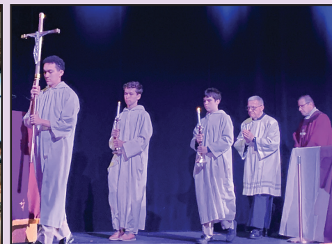
Notre Dame Jr./Sr. High School, East Stroudsburg