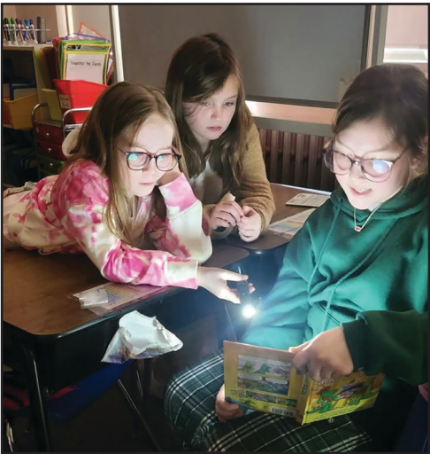
Showing students that reading can be fun and exciting, the team at Saint Mary of Mount Carmel School in Dunmore energizes students with “Flashlight Friday Reading.”