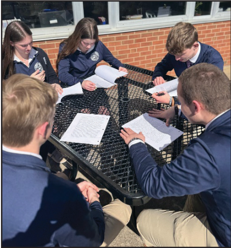
On a beautiful spring day, students at Saint John Neumann Jr./Sr. High School in Williamsport soaked up the sun while soaking in knowledge with time spent in an outdoor classroom.