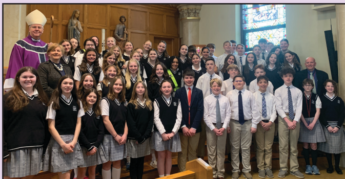
Good Shepherd Academy, Kingston