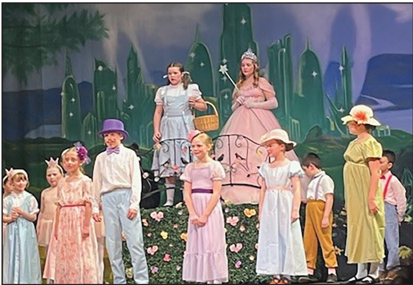
Students from Saint Agnes School in Towanda clicked their heels and were magically transported to Kansas and the Emerald City during an April weekend, performing “The Wizard of Oz” youth edition to the delight of theatergoers.