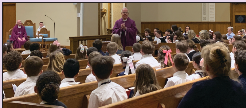
Saint Clare/Saint Paul School, Scranton