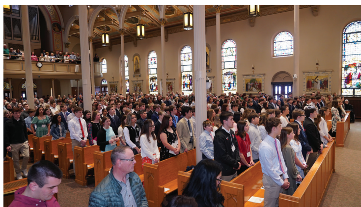
Young adults and their families from parishes in the northern region of the Diocese of Scranton filled the Cathedral of Saint Peter in Scranton to capacity on April 6, 2025, to celebrate the third and final Bishop's Youth Awards Mass of this year.