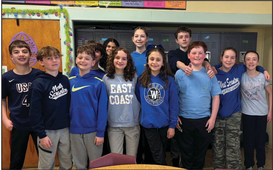
Students from All Saints Academy in Scranton had the privilege of a “blue dress down day” in support of Autism Awareness.