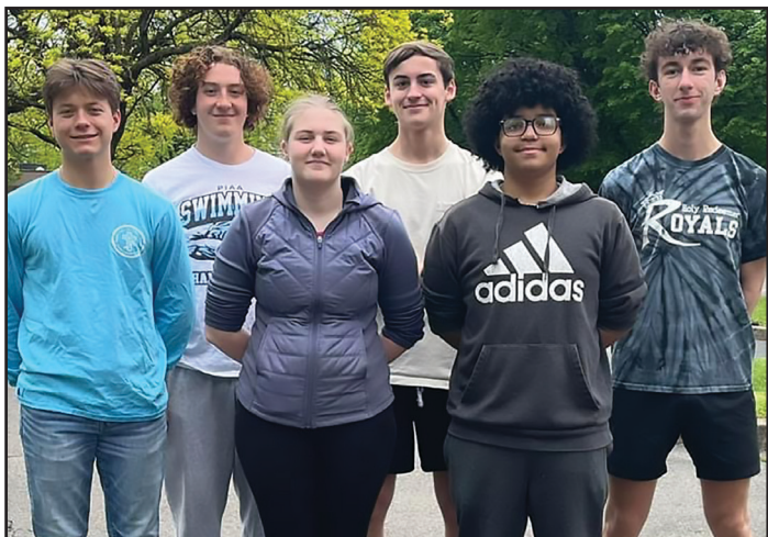
Members of the Student Leadership Council from Holy Redeemer High School in Wilkes-Barre share their time and talent by participating in the school's annual outdoor clean-up project.

The Diocese of Scranton is committed to educating our students in an environment that is academically excellent and facilitates the development of moral judgment and Christian decision-making. We are proud to share the following successes of our students in the classroom and in their service to others. Each day, our schools are fulfilling their mission of preparing today's youth and young adults to become tomorrow's faith-filled leaders.