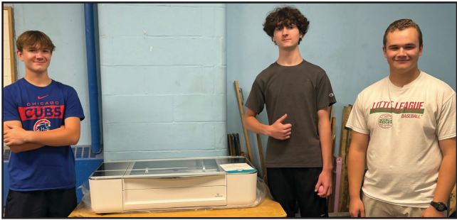
Students at Saint John Neumann Jr./Sr. High School in Williamsport spent part of their summer setting up the school's new state-of-the-art laser engraver, which will allow them the opportunity to enhance their art & wood projects.