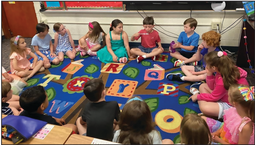
First grade students from Saint Clare/Saint Paul School in Scranton will miss their morning meetings as the school year came to an end. The students loved using their breathing ball and bubble breathing to help them focus and relax.