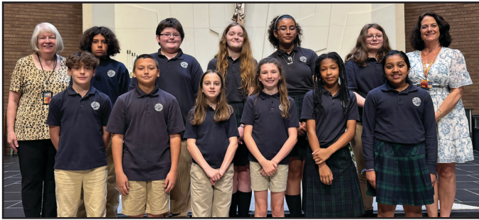
Congratulations to the fifth grade class at Saint John Neumann Elementary School in Williamsport as they are moving up to sixth grade and getting ready for an exciting new chapter as junior high school students.