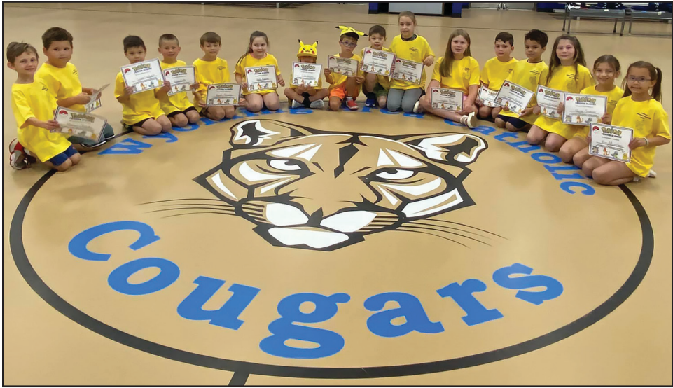
Students in first through fourth grades at Wyoming Area Catholic School in Exeter participated in a fun summer camp, "Become a Pokémon Trainer," where they completed themed projects, played games, and received and traded Pokémon cards.