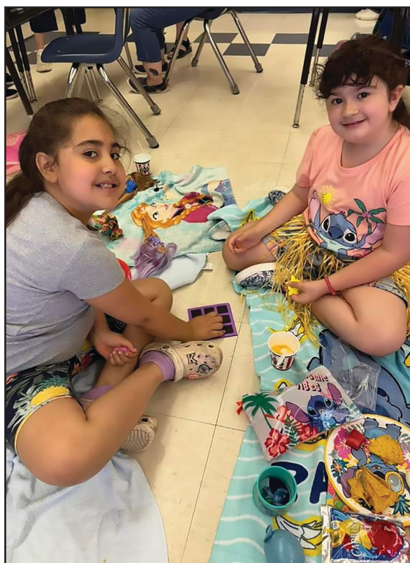
Second grade students at Holy Family Academy in Hazleton started planning for their summer adventures when the school hosted an end-of-year Hawaiian party.