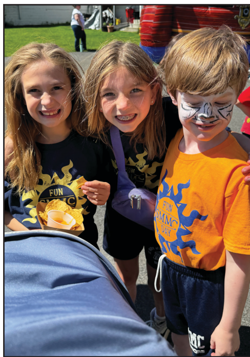
Students at Saint Mary of Mount Carmel School in Dunmore celebrated the end of the school year with "FUN DAY."