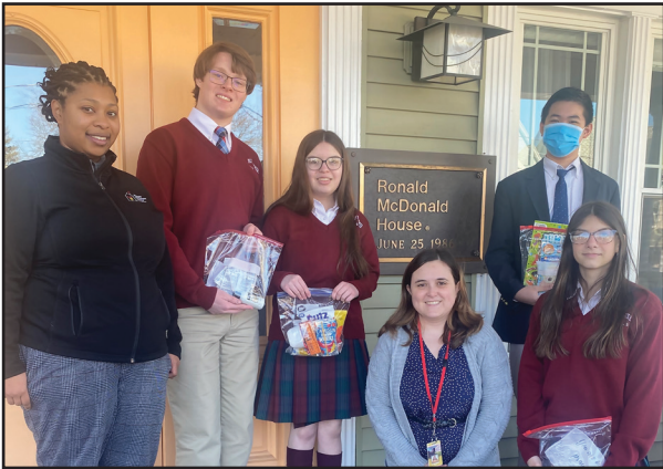
As part of their Lenten service project, the sophomore class at Holy Redeemer High School in Wilkes-Barre decided to collect items of comfort for the families staying at the Ronald McDonald House in Scranton. They are shown recently delivering the packages.