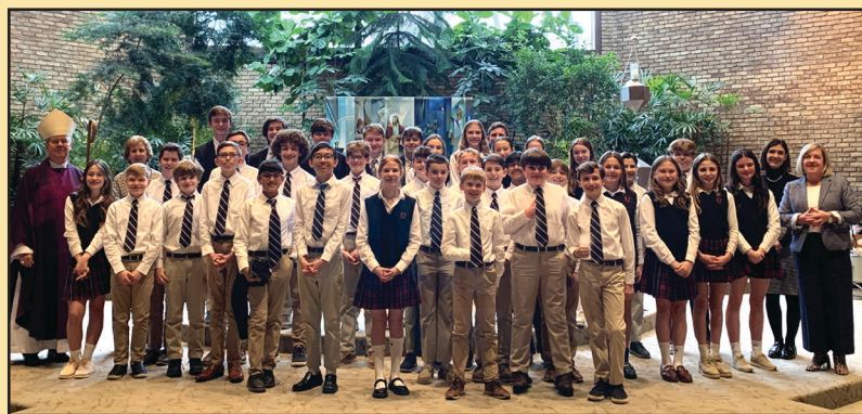
Our Lady of Peace School in Clarks Green