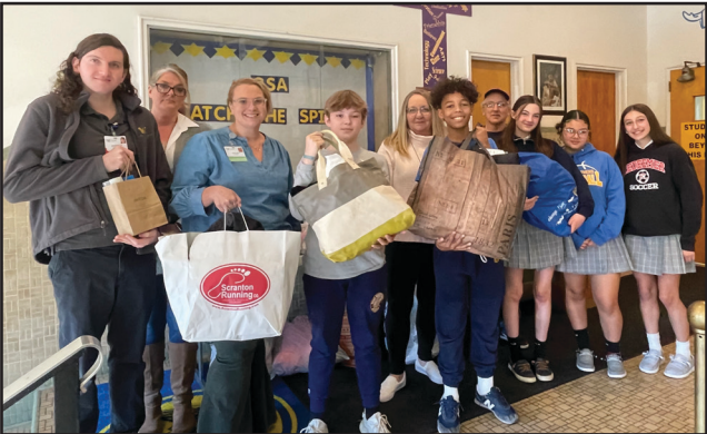
The Student Council at Good Shepherd Academy in Kingston collected clothing and personal hygiene products for the patients at the Wyoming Valley Behavioral Hospital. The hospital recently opened to assist patients in the Greater Wyoming Valley, and the Student Council coordinated the collection in conjunction with Super Bowl Sunday.