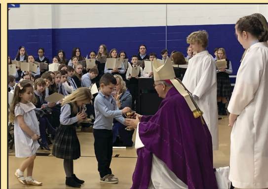
Wyoming Area Catholic School in Exeter