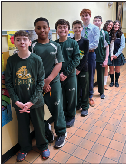
The Middle School Reading Team at All Saints Academy in Scranton is preparing for the Reading Tournament at the NEIU next month.