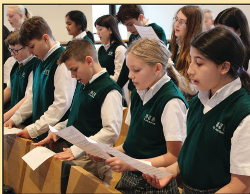
Saint Jude School in Mountain Top