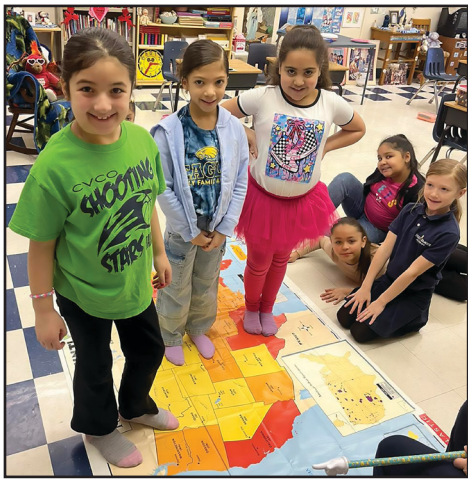
"The Nifty Fifty States" would be a good song for the second graders at Holy Family Academy in Hazleton , as they learn all about the United States.