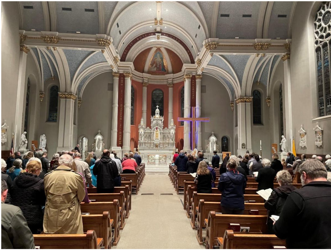
A Lenten Holy Hour was held on Feb. 28, 2024, at Saint Joseph the Worker Parish in Williamsport.