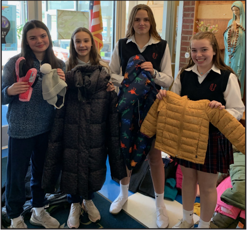
Our Lady of Peace School in Clarks Green — Student-athletes collected winter coats for the Family to Family program.