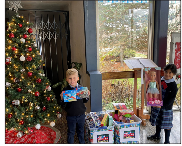
Notre Dame Elementary School in East Stroudsburg — Students are donating gifts to Toys for Tots.