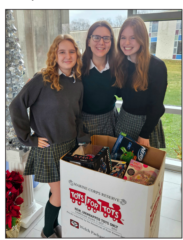
Notre Dame Jr./Sr. High School in East Stroudsburg — The school community is supporting the U.S. Marine Corps Toys for Tots drive.