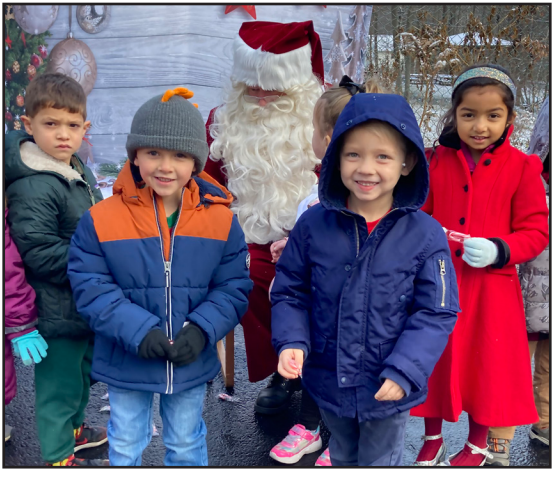
Saint Jude School in Mountain Top — Students had a special dress-down day collection with all proceeds going to purchase gifts for veterans at the VA Hospital in Wilkes-Barre.