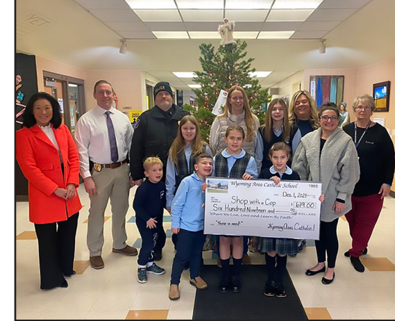
Wyoming Area Catholic School in Exeter — Students collected money to sponsor Pittston's Shop with a Cop Christmas program.