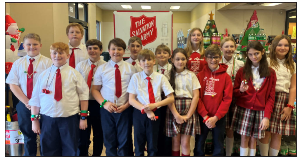
Saint Agnes School in Towanda — Students were bell ringers at a local store supporting the Salvation Army.