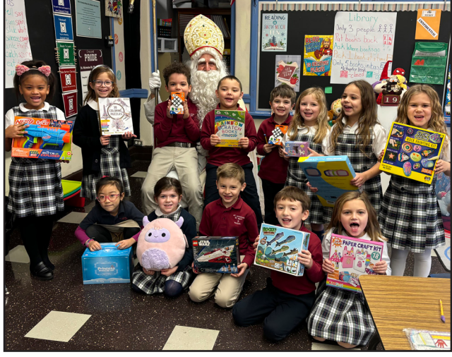
Saint Nicholas/Saint Mary School in Wilkes-Barre — Students collected toys for children in need.

Saint Mary of Mount Carmel School in Dunmore — 2,340 pairs of socks were collected for the Visiting Nurses Association and distributed through Meals on Wheels.