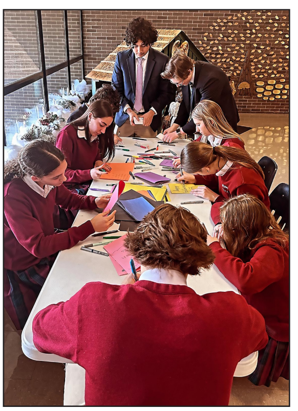
Holy Redeemer High School in Wilkes-Barre — Students partnered with the Community Intervention Center in Scranton to create bag lunches for those experiencing homelessness. Each bag also contained a hand-written note of encouragement from students.