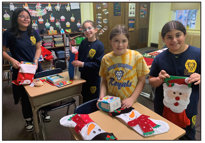
Holy Rosary School in Duryea — Student Council filled 122 stockings with toys and delivered them to the children who are patients at the Janet Weis Children's Hospital in Danville.