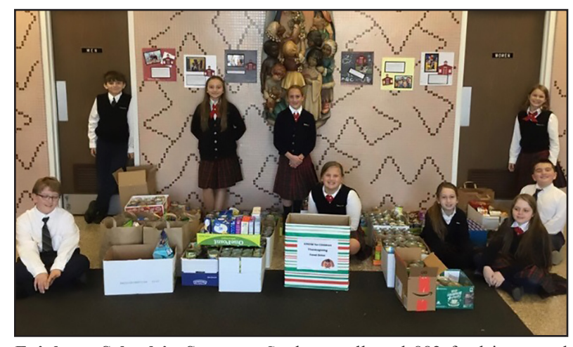
Epiphany School in Sayre — Students collected 882 food items and monetary donations for the CHOW food pantry.