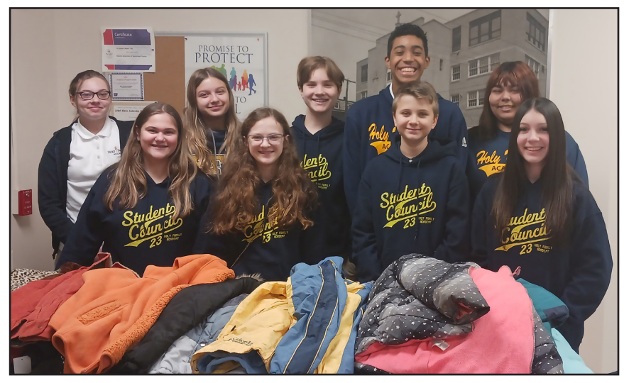
Holy Family Academy in Hazleton — "Students of Service" conducted a coat drive for Brandon's Forever Home.