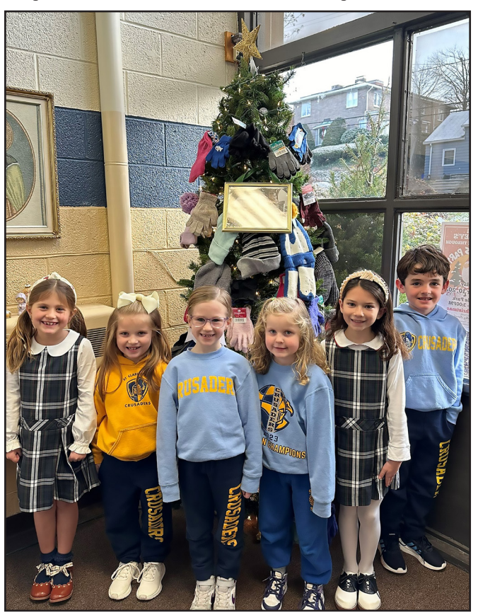
Saint Clare/Saint Paul School in Scranton — The school community is collecting mittens and gloves to be donated to the parish's food pantry.