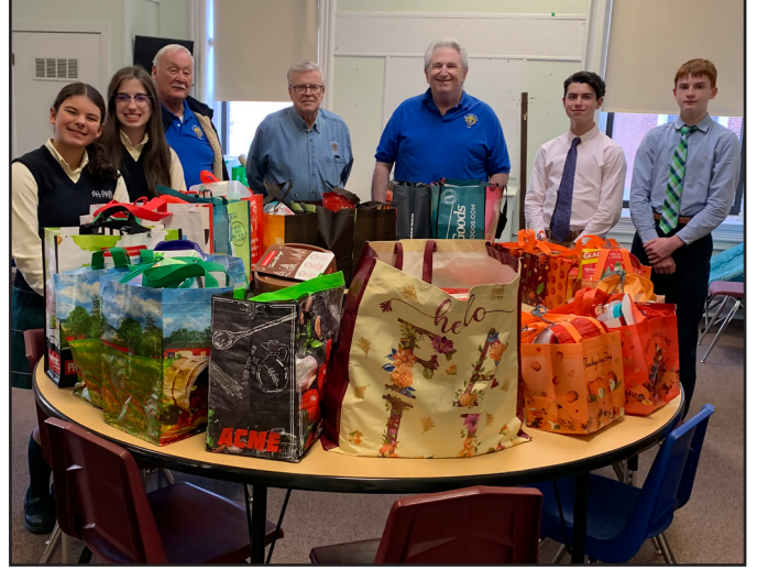
All Saints Academy in Scranton — Students partnered with their local Knights of Columbus to host a food drive.