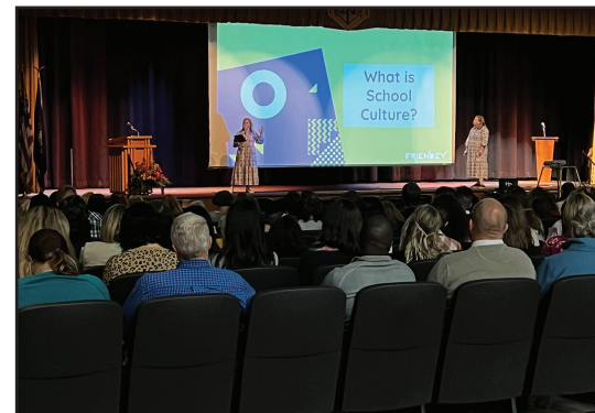
Following Mass, educators and administrators took part in professional development programs.