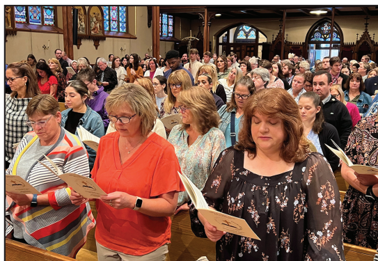
Catholic school educators celebrate the Diocesan Teachers' Institute Mass on Sept. 25, 2023.

During the Mass, the educators recited the 'Prayer of Commitment' to the ideals of Catholic education.