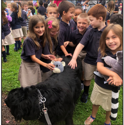
It was a special day for students and their dogs, cats and stuffed animals at the annual Saint Francis Feast Day Pet Blessing at Saint Nicholas/Saint Mary School in Wilkes-Barre .