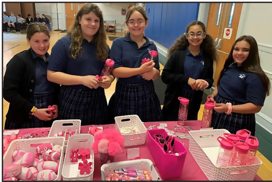
By purchasing Breast Cancer Awareness items, students at Holy Rosary School in Duryea supported The Paint Pittston Pink Foundation.