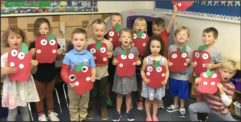
Celebrating A's! Pre-K4 students at Epiphany School in Sayre made apple-people crafts and tasted a variety of apples to see which ones they liked best as part of a STREAM activity that was based on the letter A.