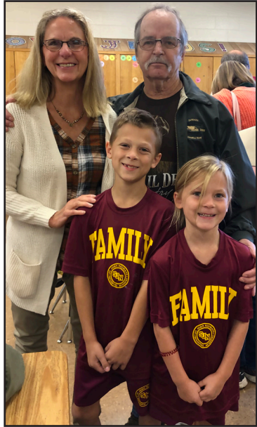
It was Grandparents Day at Saint John Neumann Elementary School in Williamsport . Students invited grandparents and their special adults to lunch and tour their classrooms to celebrate.