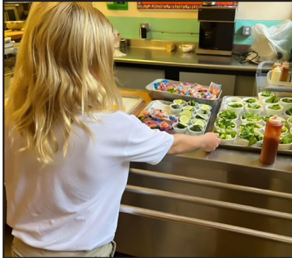
With their new Hydroponica system, second graders at Saint Agnes School in Towanda harvested some delicious lettuce that they graciously shared and was served as part of the school lunch.