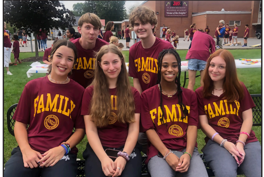
Students from Saint John Neumann Jr./Sr. High School in Williamsport take a much-needed break during the school's annual Noble Knights Walk-A-Thon, held at the beginning of each school year.