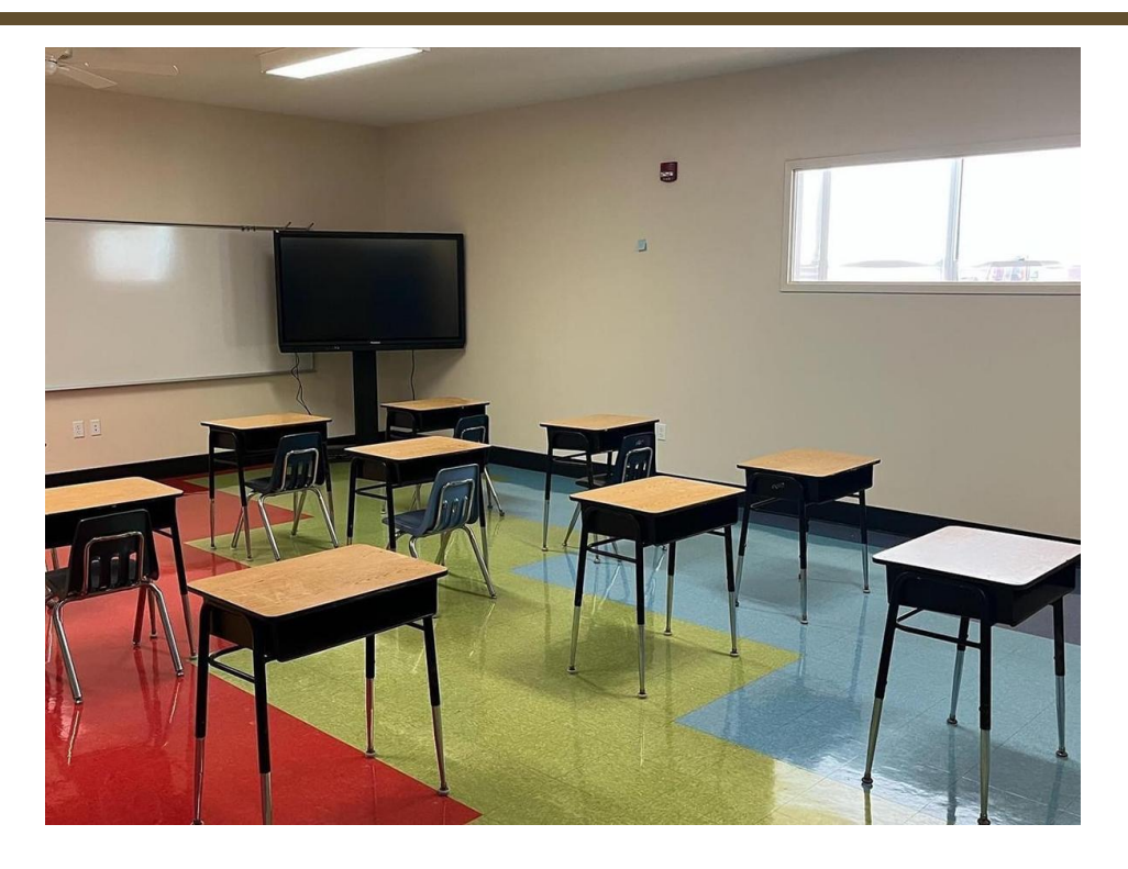
After a renovation project that took several months, Our Lady of Peace Catholic School in Clarks Green has two new classrooms for third grade students to learn in this year.

Over the next two weeks, the Diocese of Scranton Catholic School System will proudly welcome back thousands of students for the start of the 2023-24 school year.