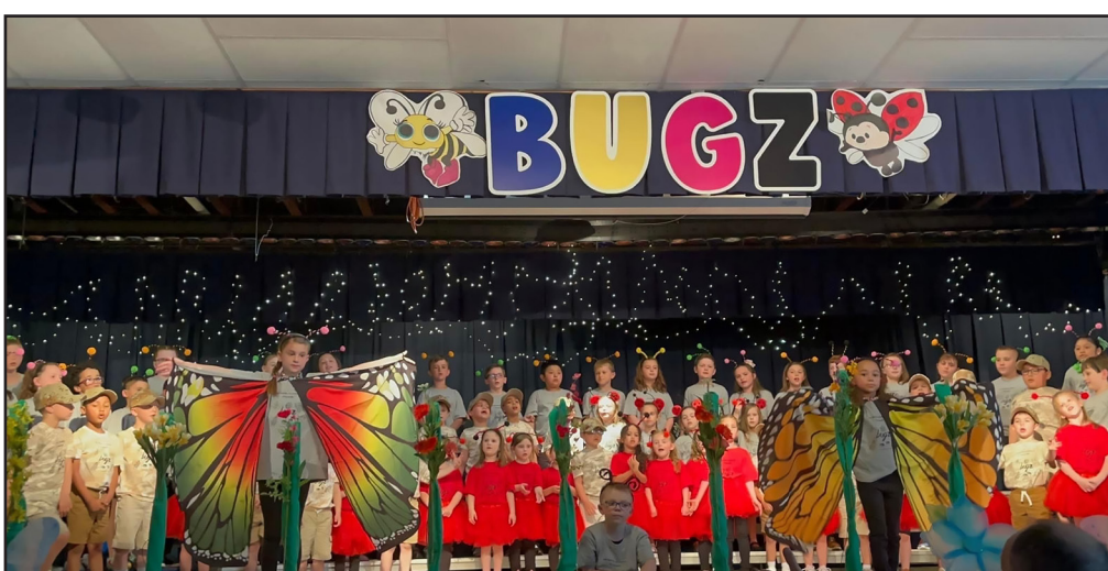
There's a lot of buzz at All Saints Academy in Scranton . Students in pre-kindergarten through second grade ended the school year performing their play "BUGZ."