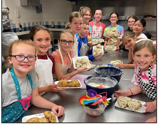
Students from Holy Rosary School in Duryea create a variety of tasty treats during the school's annual summer baking camp.