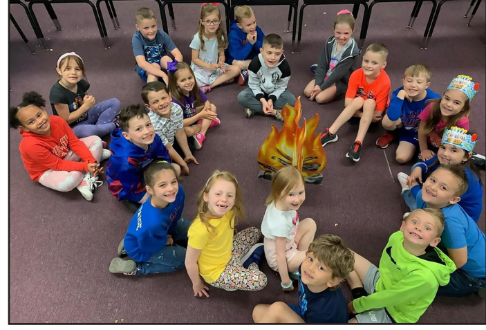
These youngsters from La Salle Academy in Jessup never want to leave as they spent time "camped out" in kindergarten during their final week of school.