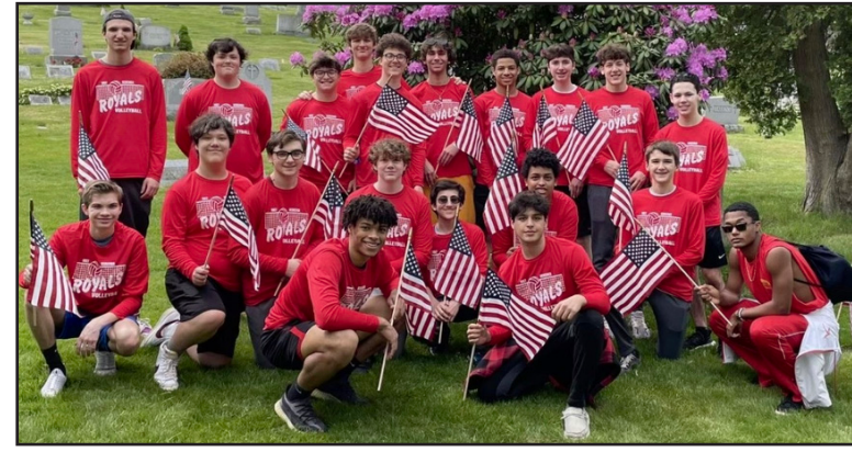
The volleyball team from Holy Redeemer High School in Wilkes- Barre played "Like a ROYAL" showing leadership both on the court and in our community as they placed flags on the graves of veterans laid to rest at Saint Mary's Cemetery.