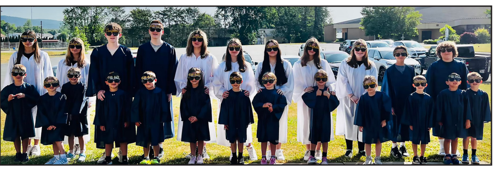
Graduation season at Wyoming Area Catholic School in Exeter — the eighth graders pose in their gowns with the kindergarten graduates just before the 2022-23 school year ended.