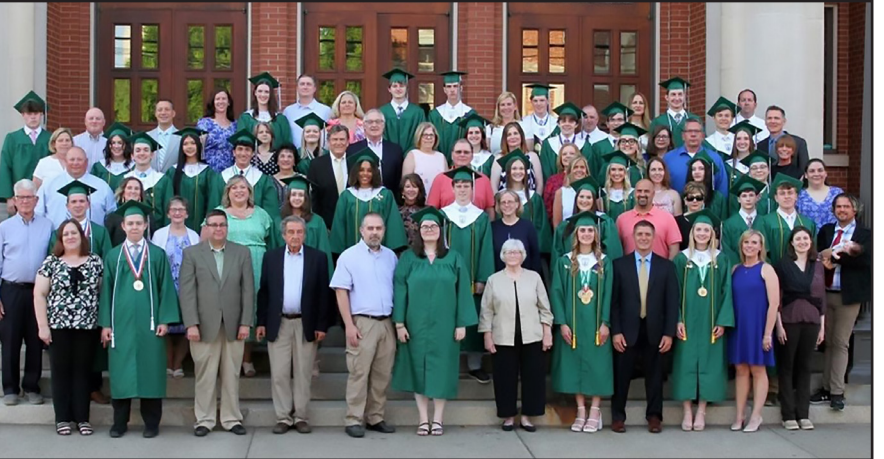
The legacy members of the Class of 2023 from Holy Cross High School in Dunmore pose in front of the Cathedral of Saint Peter in Scranton with their parents and grandparents, all graduates of a Diocesan high school.