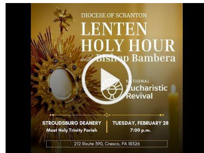
Most Holy Trinity Parish Cresco

Saying Rosary as family seen as one way to fulfill Lenten pillar of prayer