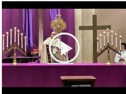
Saint Rose of Lima Parish Carbondale