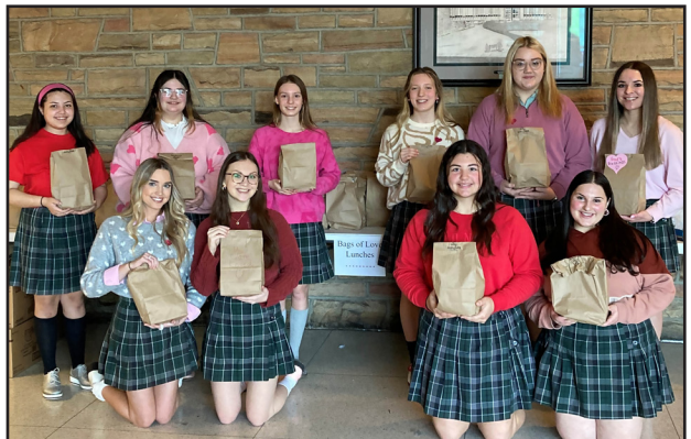
Students from Holy Cross High School in Dunmore spent their Valentine's Day offering LOVE through acts of service this year. The student body created "Bags of Love," including a sandwich, drink and fruit, which were donated to Saint Francis of Assisi Kitchen in Scranton.