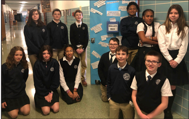
The sixth grade class at Saint John Neumann Elementary School in Williamsport celebrated Black History Month by decorating their door for Frederick Douglass' birthday and showing how he impacted America.