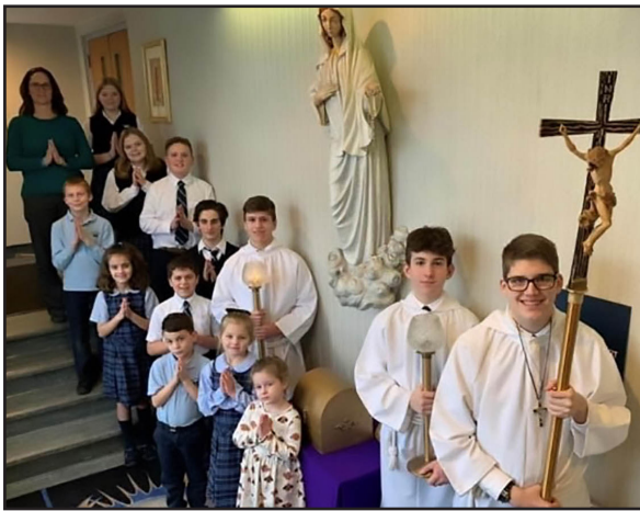
Holy Rosary School in Duryea held its traditional "Bury the Alleluia" ceremony as they began their Lenten season of sacrifice.