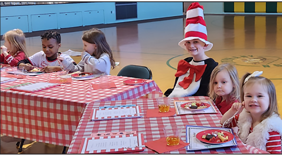
Kindergarten and pre-K students at Epiphany School in Sayre celebrated "Read Across America Week" with a Bookapalooza and picnic. As an extra surprise, their sixth grade buddies dressed as Dr. Seuss characters.

As part of the STREAM Initiative, the eighth grade class at Good Shepherd Academy in Kingston chose kindergarten "Reading Buddies." The "buddies" chose to read and discuss the Science of "The Very Hungry Caterpillar" and discussed listening skills, accurate recording, critical analysis, and drawing conclusions.