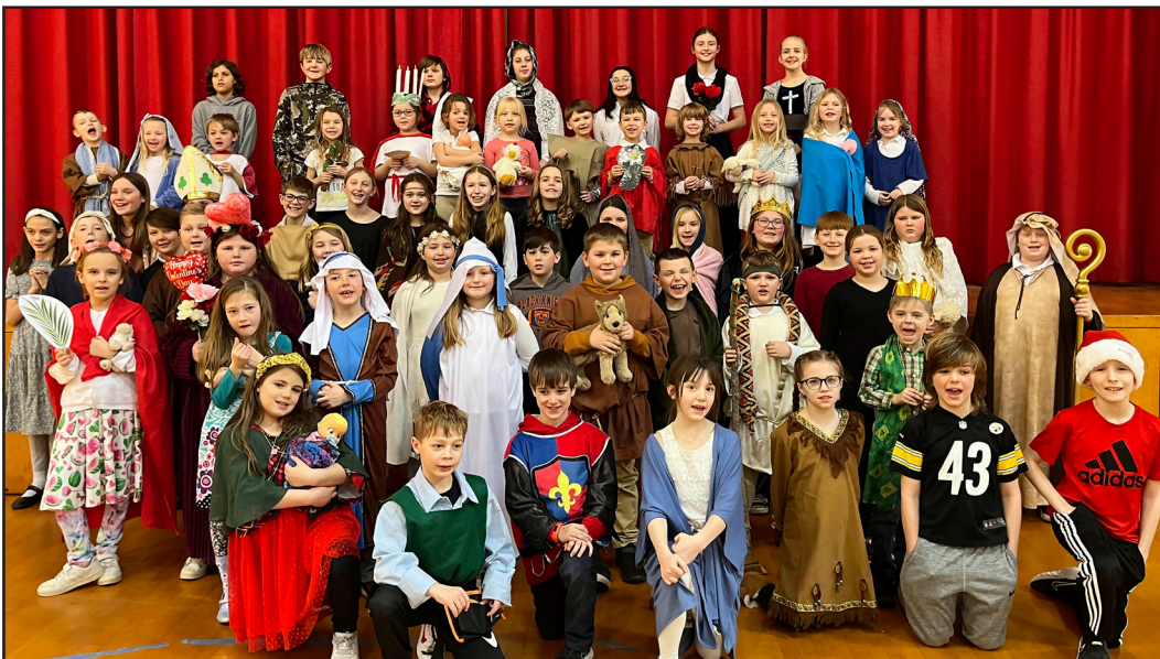
Students at Saint Agnes School in Towanda dressed like their favorite saints.