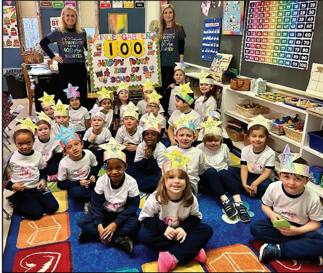
The Kindergarten class at Notre Dame Elementary School in East Stroudsburg crafted special crowns to wear to celebrate the 100th day of school.