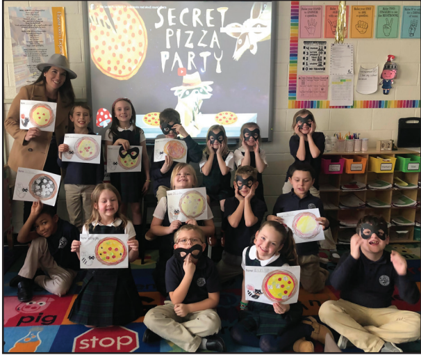
The first grade class at Saint John Neumann Elementary School in Williamsport celebrated “Read Across America Week” by doing classroom reading activities and pairing up to read to one another.