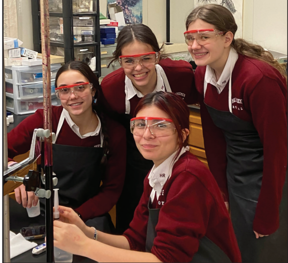
Advanced Placement (AP) Biology students from Holy Redeemer High School in Wilkes-Barre perform hands-on science experiments as they embrace the scientific method learning process.