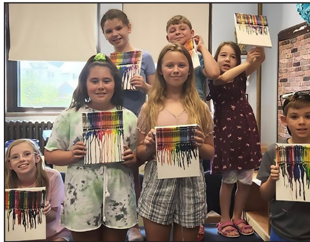
Students from Saint Mary of Mount Carmel School in Dunmore harnessed the power of the sun to make crayon drip artwork at one of the school's summer activities.