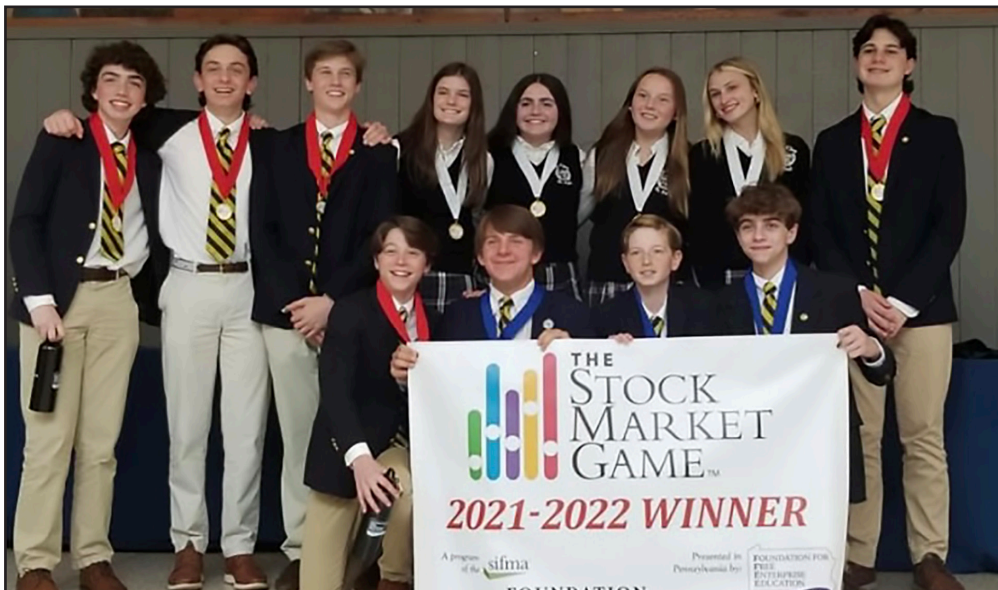
Twelve students from Saint Clare/Saint Paul School in Scranton took the top three positions, not only in their region but also in the state, for the National Stock Market Game. The Stock Market Game is an online simulation of the global capital markets that engages students grades 4 through 12 in the world of economics investing and personal finance.