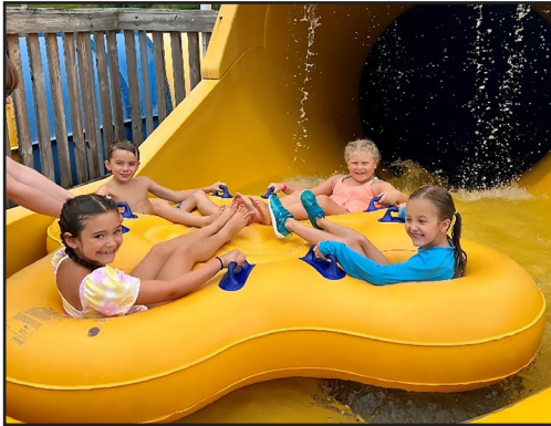
Students from Holy Rosary School in Duryea made a splash as they enjoyed the day with family and friends at Montage Water Park, an outing sponsored by the school's PTO.