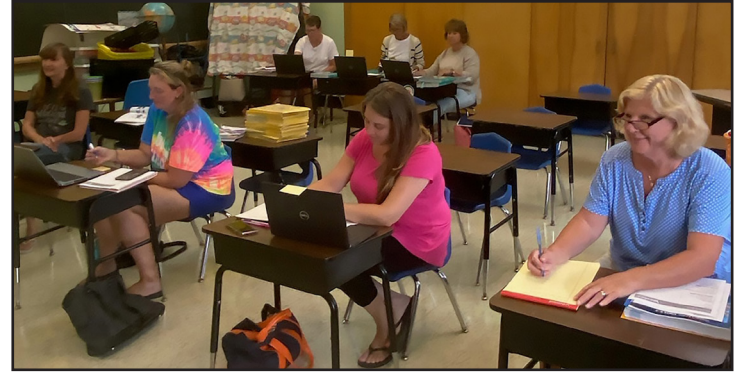
Several teachers from Good Shepherd Academy in Kingston gathered during the summer months to familiarize themselves with the new reading series "Wonders" so they are ready when school resumes at the end of August.