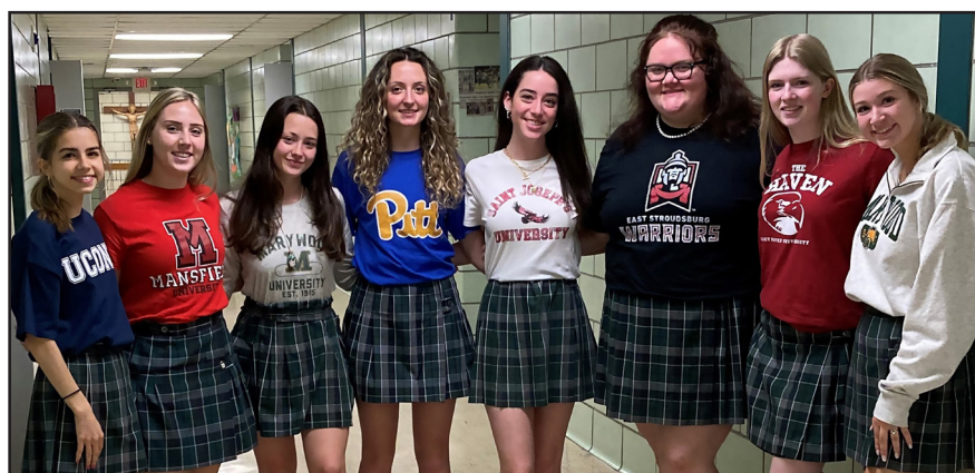
Just before graduation, seniors at Holy Cross High School in Dunmore proudly wore the shirts and sweatshirts of the college they will be attending in the fall.