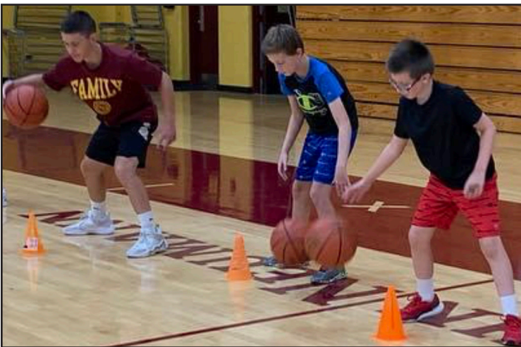
Future stars practice ball handling during summer basketball camp at Saint John Neumann Jr./Sr. High School in Williamsport .