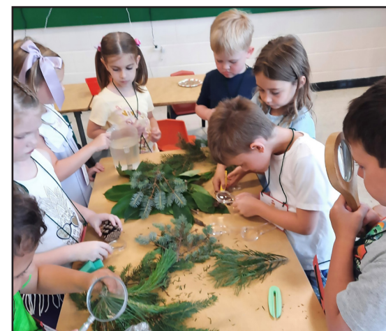
Students from All Saints Academy in Scranton investigate different kinds of trees at "Christmas in July" summer camp.