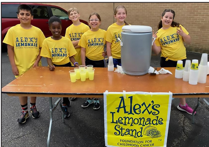
During "Fun and Field Day" at Epiphany School in Sayre , fourth graders ran an Alex's Lemonade Stand to raise money for childhood cancer research.