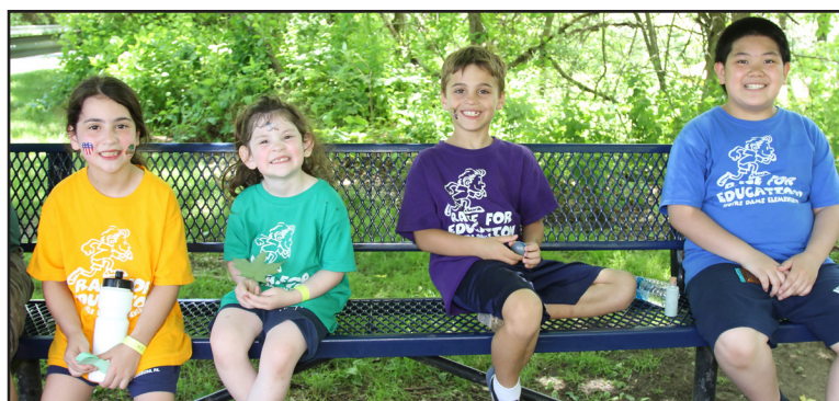
Students from Notre Dame Elementary School in East Stroudsburg take a much-needed break after participating in the school's annual field day.