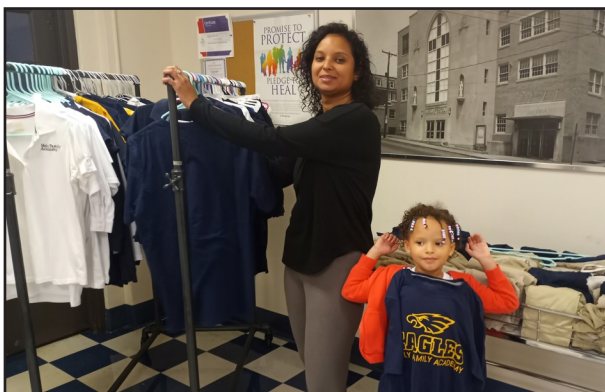
A soon-to-be pre-kindergarten student at Holy Family Academy in Hazleton and her mom look at the logoed gear available as part of the school's "Uniform Closet."

The Diocese of Scranton is committed to educating our students in an environment that is academically excellent and facilitates the development of moral judgment and Christian decision-making. We are proud to share the following successes of our students in the classroom and in their service to others. Each day, our schools are fulfilling their mission of preparing today's youth and young adults to become tomorrow's faith-filled leaders.