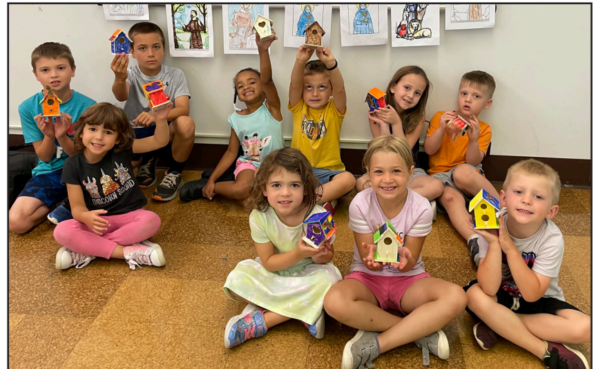
Students from Saint John Neumann Elementary School in Williamsport learned about Saint Francis by building bird houses, playing animal games and drawing pictures during the school's STREAM Camp.