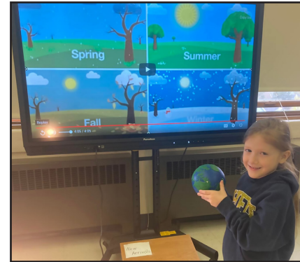
Kindergarten students at Holy Family Academy in Hazleton are learning about the solar system and how the tilting of the Earth influences our seasons.