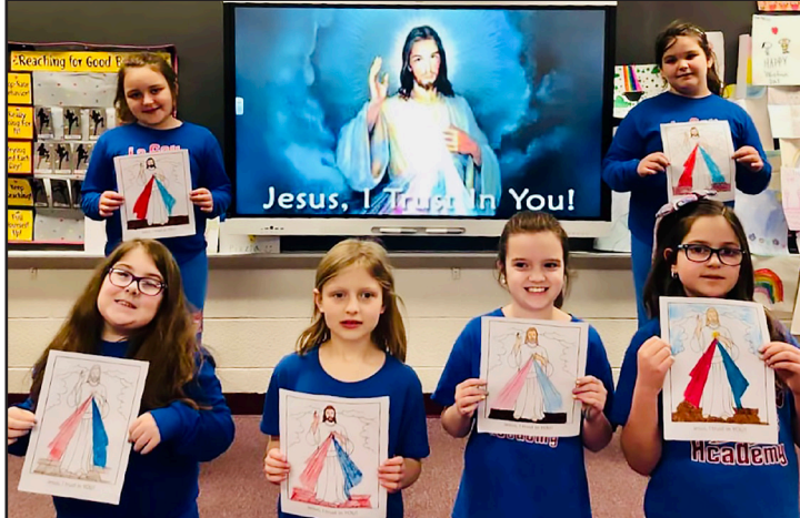
Third grade students at La Salle Academy in Jessup learn about Divine Mercy Sunday and how to pray the Chaplet of the Divine Mercy.