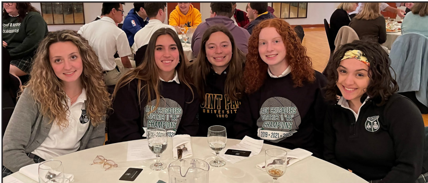
The Alumni Association of Holy Cross High School in Dunmore welcomed their newest members – the Class of 2022 – at a special Alumni Luncheon.