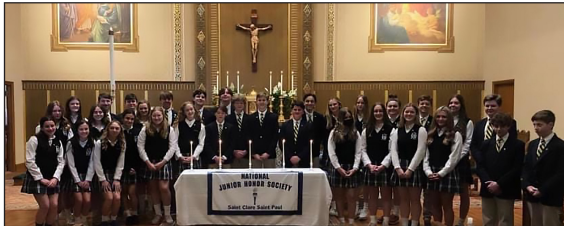
The National Junior Honor Society at Saint Clare/Saint Paul School in Scranton held its annual Induction Ceremony. The students were not only recognized for their academic accomplishments, but their dedication to service, character, leadership and citizenship as well.