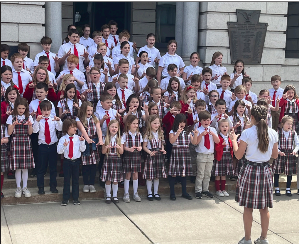
On the recent National Day of Prayer, students from Saint Agnes School in Towanda recited prayers on the steps of the Bradford County Courthouse.