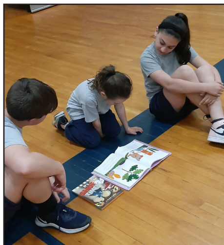
Sixth graders at Saint Nicholas/Saint Mary School in Wilkes-Barre are helping first graders develop reading skills by reading to each other.