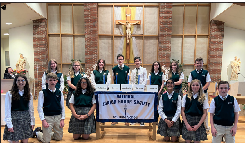
The National Junior Honor Society at Saint Jude School in Mountain Top recently inducted new members.