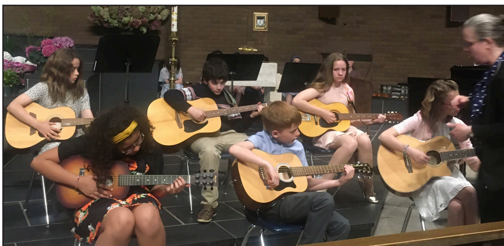
Guitar players from Saint John Neumann Elementary School in Williamsport shared their talents on the guitar during the Spring Arts Festival.