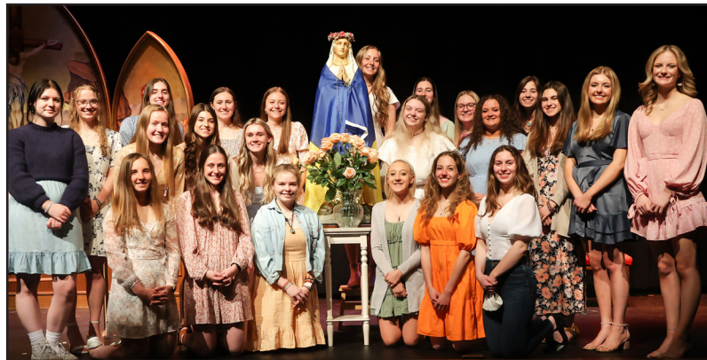
The Senior Class at Holy Redeemer High School in Wilkes-Barre recently gathered for one of the last times before graduation during their May Crowning liturgy. Female students served as a court of honor for the Blessed Mother as Our Lady was crowned with flowers.