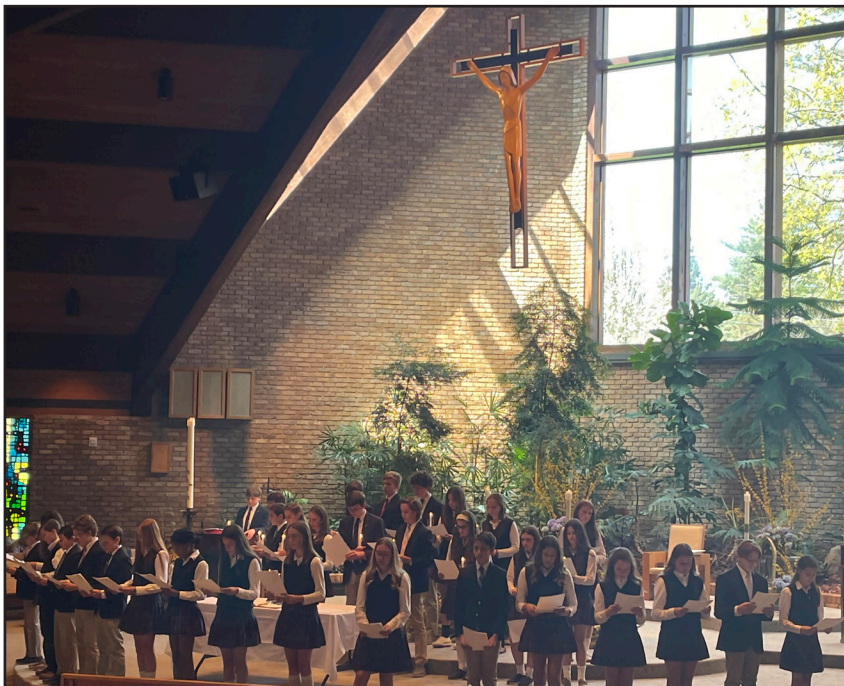
The National Junior Honor Society of Our Lady of Peace School in Clarks Green recently inducted new members at a ceremony at the Church of Saint Gregory.