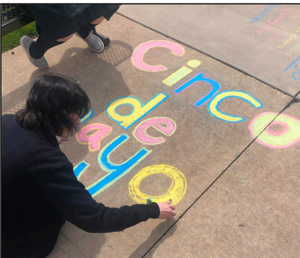
Students in the Spanish classes at Saint John Neumann High School in Williamsport recently celebrated "Cinco de Mayo," a commemoration of Mexican culture and heritage.