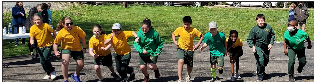
Ready, Set, Go! Students at Epiphany School in Sayre held their 19th Annual Race for Education to raise money for the school's technology and STREAM programs. The students ran a total of 1,690 laps around the school, earning $15,000 in donations.