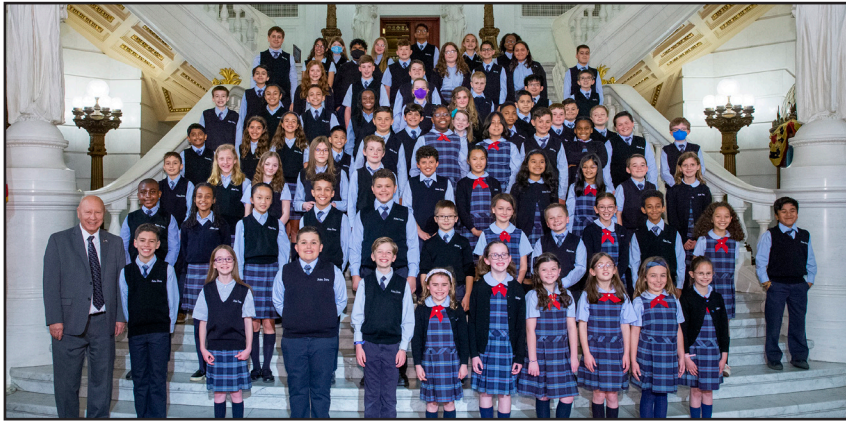
Fourth, fifth and sixth grade students from Notre Dame Elementary School in East Stroudsburg recently entertained state lawmakers and visitors at the State Capitol in Harrisburg. The students sang, danced and played musical instruments before enjoying a tour and lunch.

The Diocese of Scranton is committed to educating our students in an environment that is academically excellent and facilitates the development of moral judgment and Christian decision-making. We are proud to share the following successes of our students in the classroom and in their service to others. Each day, our schools are fulfilling their mission of preparing today's youth and young adults to become tomorrow's faith-filled leaders.