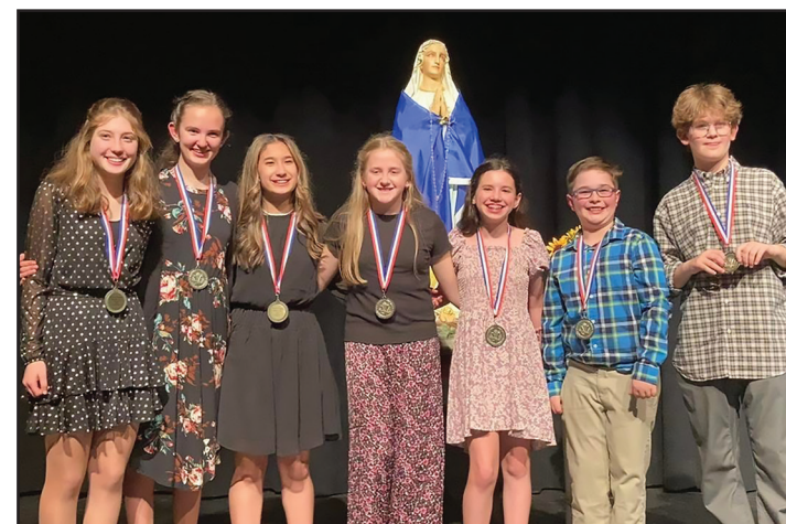
The Varsity and Junior Varsity Forensics teams from Saint Nicholas/Saint Mary School in Wilkes-Barre celebrate their recent victories.