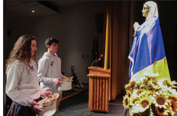
Students at Holy Redeemer High School in Wilkes-Barre present their notes of prayer and support for Ukraine as they watched the livestream Mass of Consecration to the Immaculate Heart of Mary from the Cathedral of Saint Peter in Scranton.