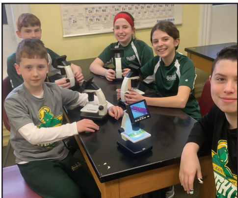
Sixth graders at All Saints Academy in Scranton spend time learning how to properly work their new microscopes.

The Diocese of Scranton is committed to educating our students in an environment that is academically excellent and facilitates the development of moral judgment and Christian decision-making. We are proud to share the following successes of our students in the classroom and in their service to others. Each day, our schools are fulfilling their mission of preparing today's youth and young adults to become tomorrow's faith-filled leaders.