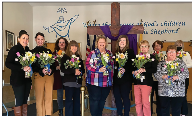
The Instructional Aides at Good Shepherd Academy in Kingston were honored at a recent liturgy for their support of the children and programs of the school.