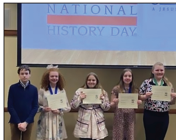
Students from Holy Rosary School in Duryea recently participated in the National History Day Competition at The University of Scranton. Students received first place in group performance, first place in group exhibit, and third place in individual exhibit.