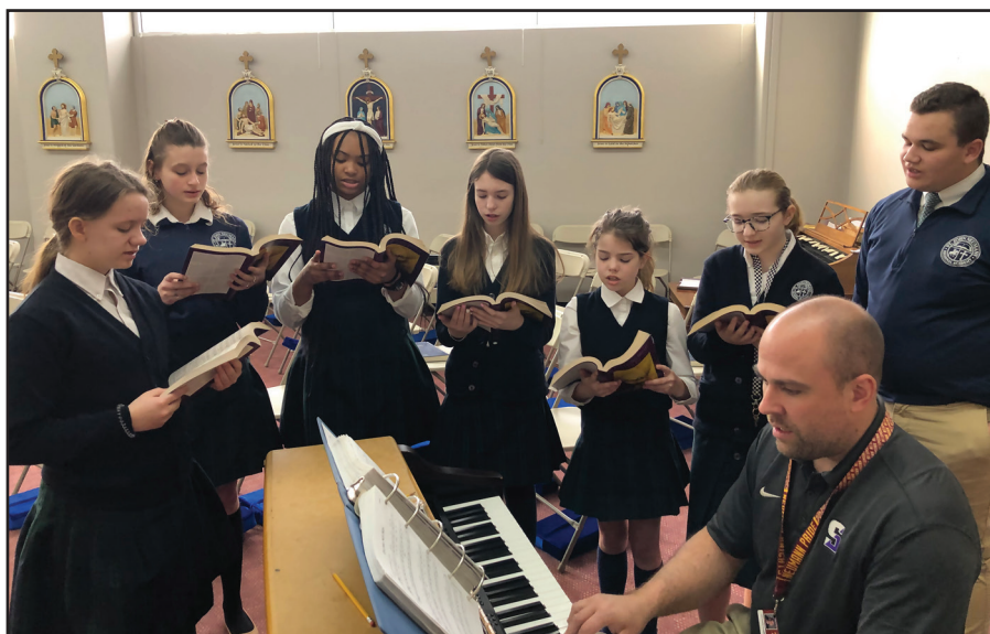
Chorus members at Saint John Neumann Jr./Sr. High School in Williamsport prepare for Mass held during Lent.