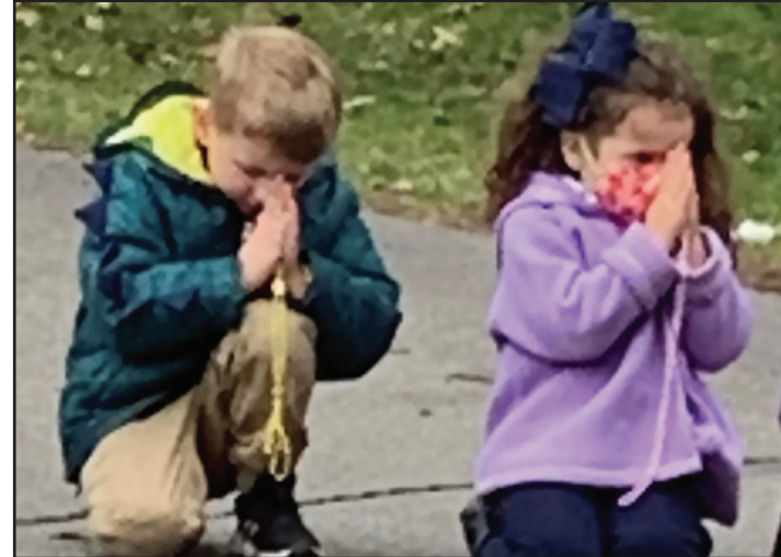
In communion with Pope Francis, students and staff at La Salle Academy in Jessup prayed the Rosary for the conversion of Russia and peace in Ukraine.