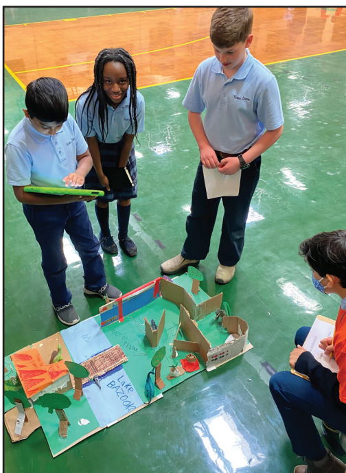
Sixth graders at Notre Dame Elementary School in East Stroudsburg participated in a science lesson golf tournament using Spheros to navigate the course.