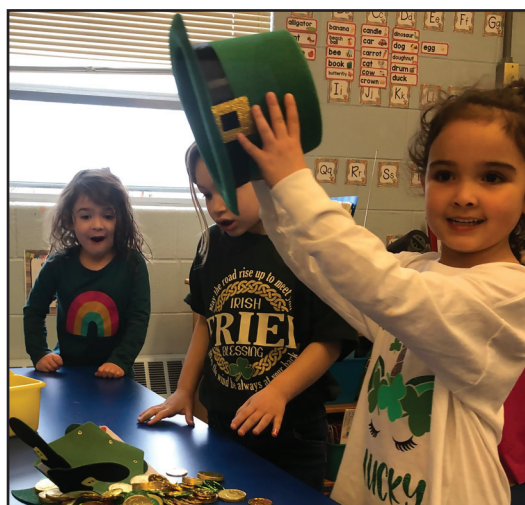
Kindergarten students at Saint John Neumann Elementary School in Williamsport look under their “Leprechaun Trap” to see if they caught anything on Saint Patrick’s Day.