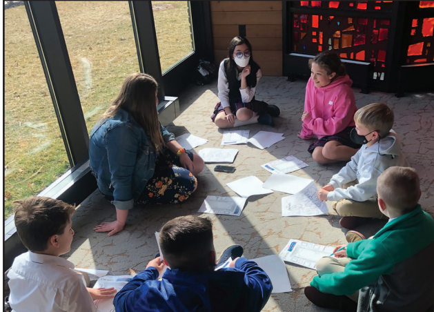
Fourth and fifth graders from Our Lady of Peace in Clarks Green work in small groups during their Lenten retreat.