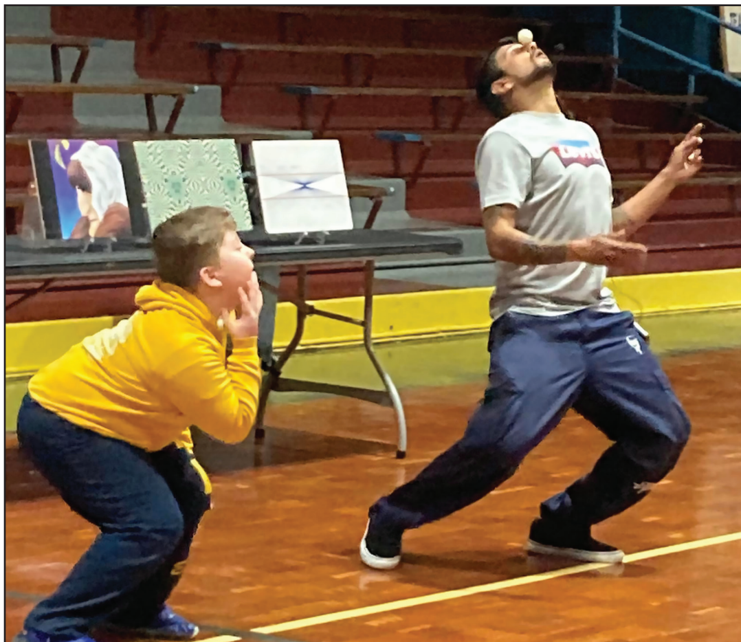
Students at Holy Family Academy in Hazleton were awed and amazed as they watched "The Magic of Science" assembly.