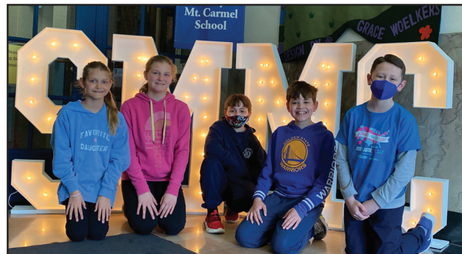
Students and staff at Saint Mary of Mount Carmel School in Dunmore dressed in pink and blue in support of the Jude Zayac Foundation, which raises awareness and funds for SIDS research.