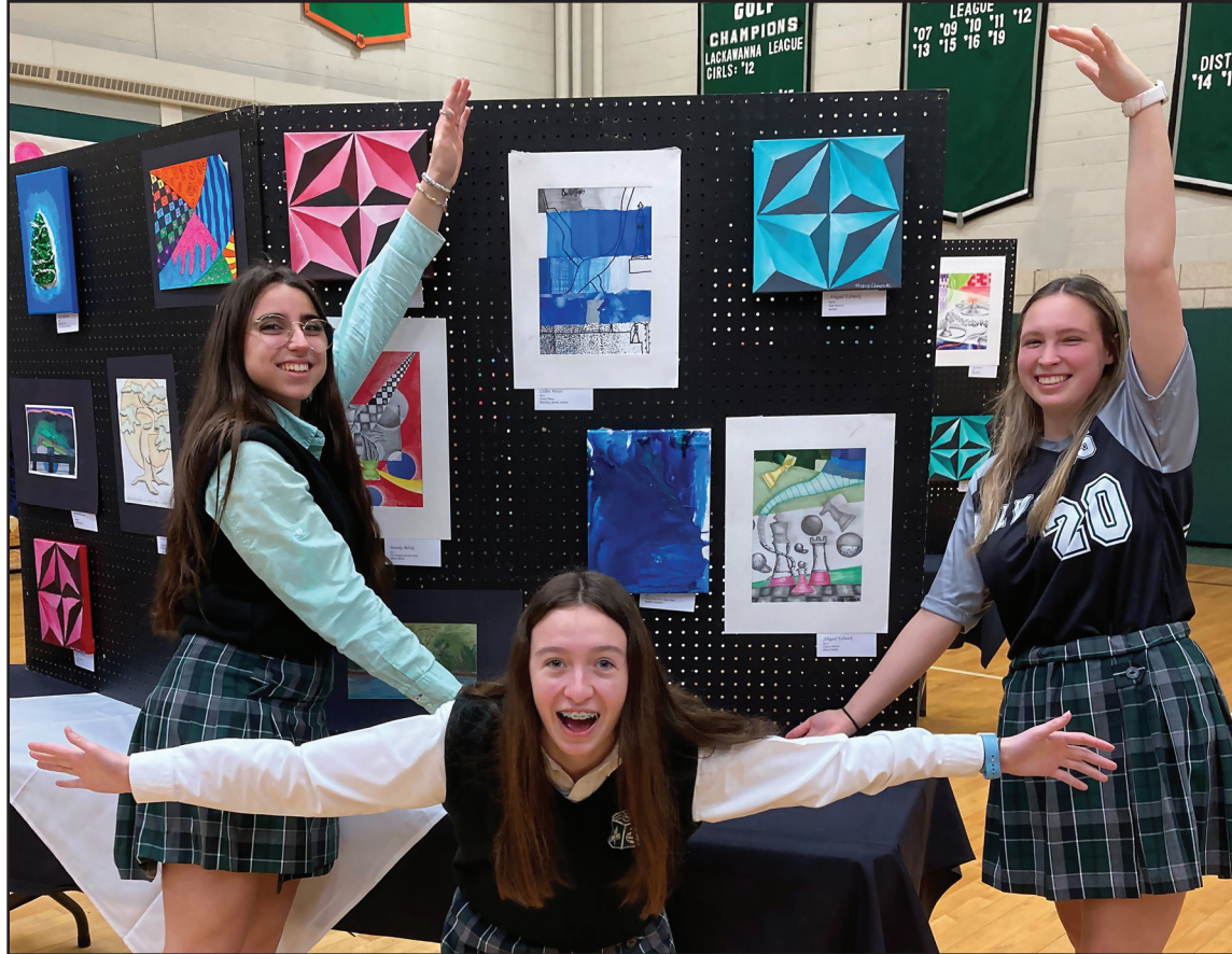
Student participants from Holy Cross High School in Dunmore prepare for their Spring Art Exhibit & Choral Concert.