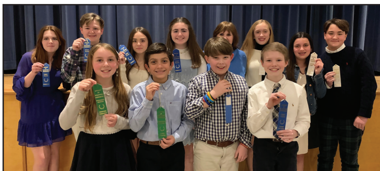
Students at Saint Clare/Saint Paul School in Scranton proudly show off their ribbons after competing in the Forensics Spring Tournament.