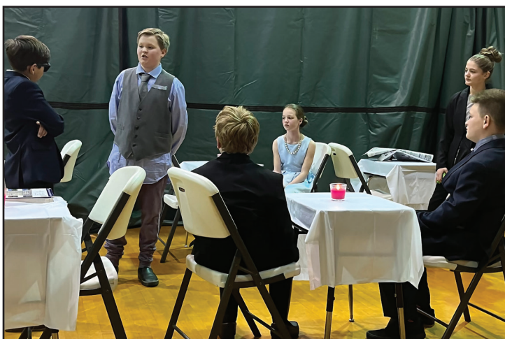
The sixth grade class from Saint Agnes School in Towanda presented “The Emerald Heist,” a mystery dinner theatre, for their families.