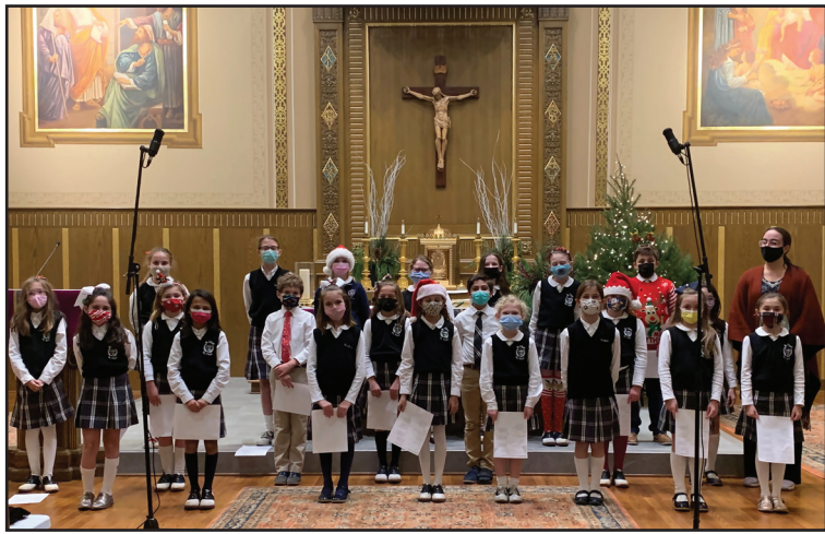
The choir from Saint Clare/Saint Paul School in Scranton practice for the Saint Paul Parish Virtual Concert.