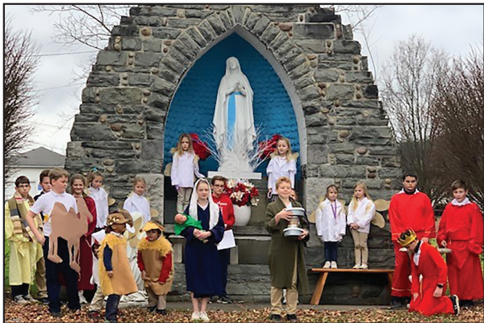
While preparing for their annual Christmas pageant and concert, students from Saint Agnes School in Towanda take a moment to pose for an official photo in commemoration of the 2021 presentation.