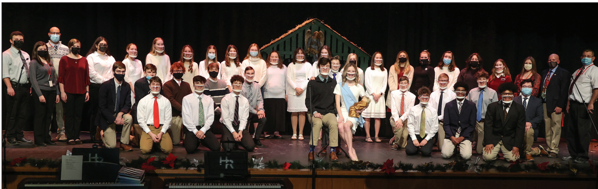
Students at Holy Redeemer High School in Wilkes-Barre presented the Living Nativity, reminding all of the true meaning of Christmas.