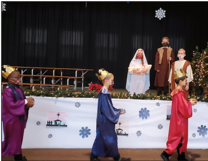
Epiphany School in Sayre recorded a Christmas Concert for families. Pictured are Epiphany students participating in the Live Nativity part of the concert.