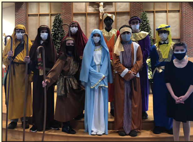
The Advent Reflection Nativity was held the week before Christmas at Saint Jude School in Mountain Top .