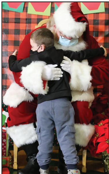
Students at All Saints Academy in Scranton , eagerly awaiting the birth of Christ, were treated to a Christmas carnival by the school's PTO.