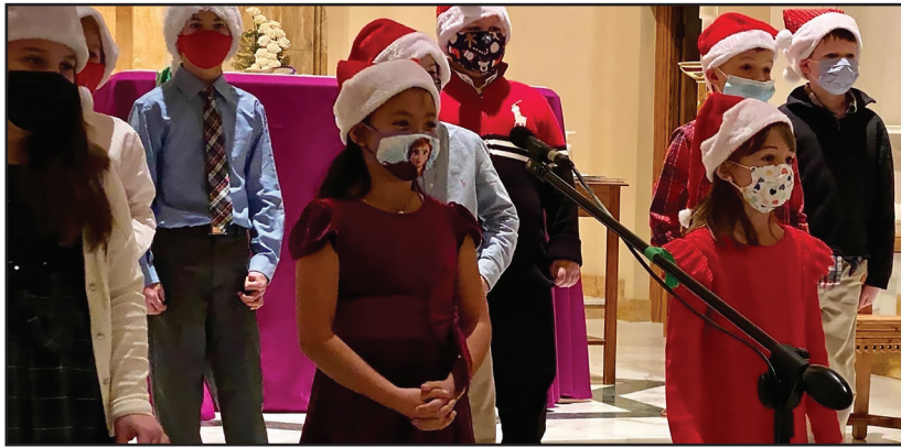
Students at Saint Mary of Mount Carmel School in Dunmore presented the sounds of the season – the waiting and then the celebrating of our Lord's birth. Pictured are second graders, dressed in their Christmas finest, performing a selection for their family and friends.