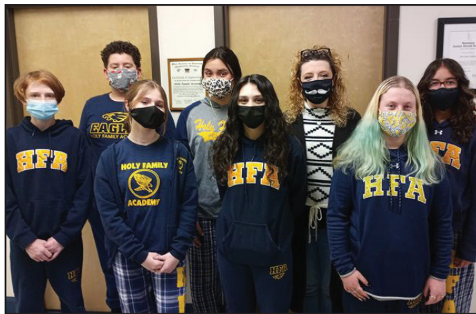
"Students of Service," a community-focused group at Holy Family Academy in Hazleton , recently collected $500 for Catholic Social Services' Divine Providence Shelter in Hazleton.