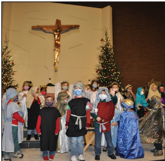
PreK-3 and PreK-4 students from Saint John Neumann Elementary School in Williamsport present a Christmas pageant for their families at Saint Boniface Church.