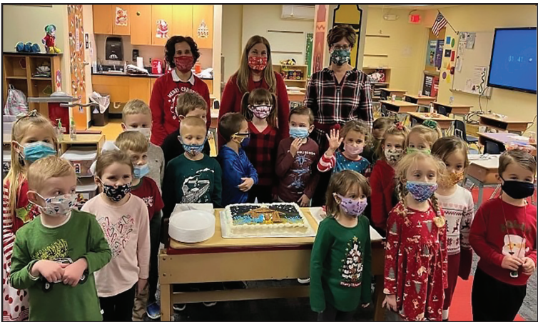
The pre-K class at Holy Rosary School in Duryea celebrate the birth of Baby Jesus with a special cake and classroom party.