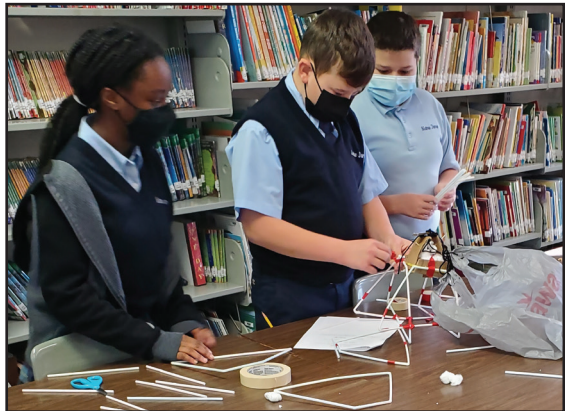
Sixth grade students at Notre Dame Elementary School in East Stroudsburg craft a vehicle to protect their egg during a STREAM engineering experiment.

The Diocese of Scranton is committed to educating our students in an environment that is academically excellent and facilitates the development of moral judgment and Christian decision-making. We are proud to share the following successes of our students in the classroom and in their service to others. Each day, our schools are fulfilling their mission of preparing today's youth and young adults to become tomorrow's faith-filled leaders.