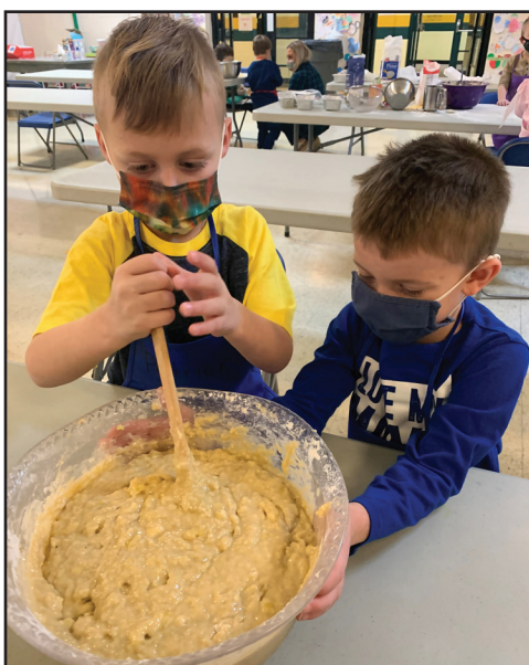
Pre-Kindergarten students at All Saints Academy in Scranton work together to measure, stir and bake banana bread to take home as part of their Thanksgiving meal.