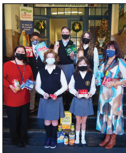
The Service Club at Saint Mary of Mount Carmel School in Dunmore recently collected personal items and non-perishable food to benefit the organization, "Purposely Preparing Others," a part of Keystone Mission.