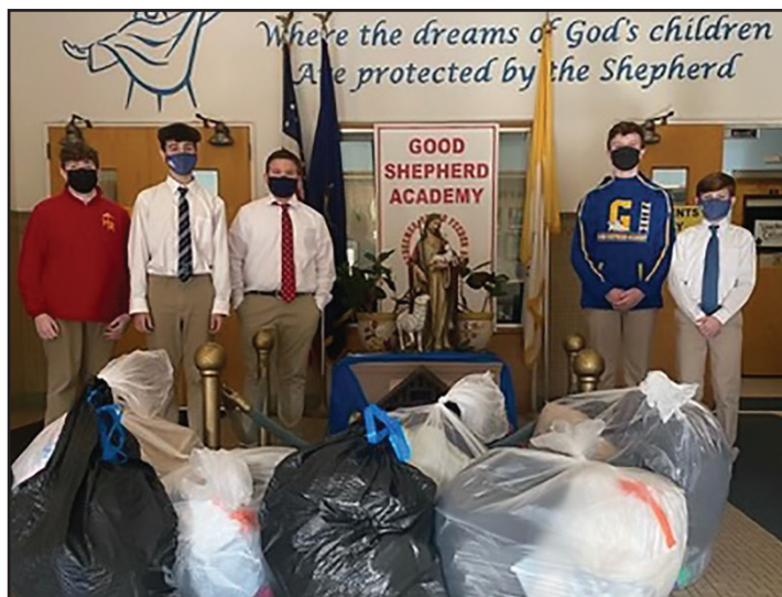
The students, faculty and staff at Good Shepherd Academy in Kingston recently collected coats for their monthly Dash for Kindness Activity. The coats were donated to the Catholic Youth Center in Wilkes-Barre for distribution to those in need.