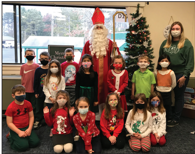
On Dec. 6, Saint Nicholas visited Saint Jude School in Mountain Top and left a little treat for everyone.

The Diocese of Scranton is committed to educating our students in an environment that is academically excellent and facilitates the development of moral judgment and Christian decision-making. We are proud to share the following successes of our students in the classroom and in their service to others. Each day, our schools are fulfilling their mission of preparing today's youth and young adults to become tomorrow's faith-filled leaders.