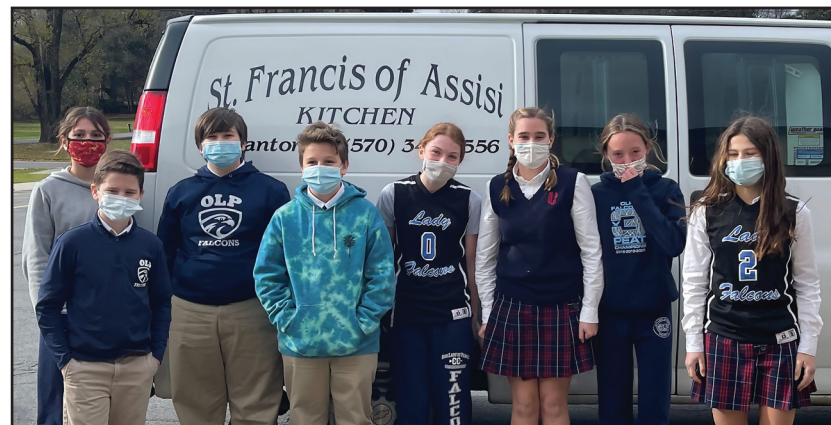
The Student Council at Our Lady of Peace School in Clarks Green organized a Thanksgiving food drive and donated several hundred food items to Saint Francis of Assisi Kitchen in Scranton.