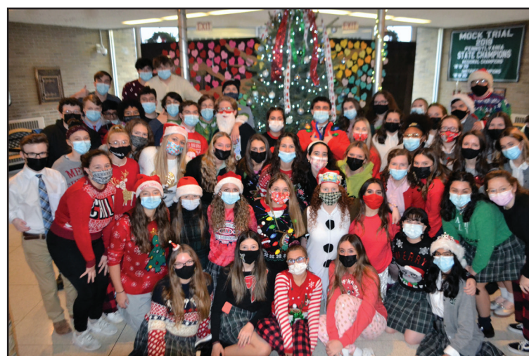
Holy Cross High School in Dunmore continues its tradition of Senior Deck the Halls. The class of 2022 gathered to trim the tree and decorate the school and then celebrated their efforts with a pizza party.