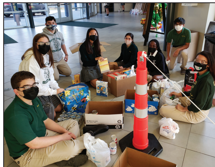
Student Council members from Notre Dame Jr./Sr. High School in East Stroudsburg organize bags of food that fellow students and faculty brought in to be donated to the food pantry at Saint Matthew Parish.