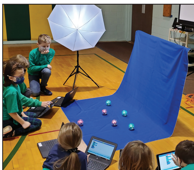
Students in third through sixth grade at Epiphany School in Sayre work in teams to code a fleet of Sphero robots to dance to a Christmas song during the school's fifth Annual "Hour of Code" event. The students used green screens to record and share their dances with the rest of the school community.