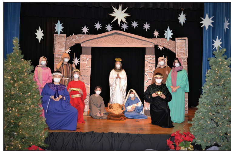
The eighth grade class of Holy Rosary School in Duryea performed the story of the Nativity which was filmed for the entire school community to enjoy during this holy season.