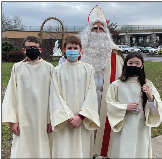
Saint Nicholas made a special visit to the students at Saint Nicholas/Saint Mary School in Wilkes-Barre on his feast day to share stories of how to prepare for Christmas. He also filled the students' shoes with treats.