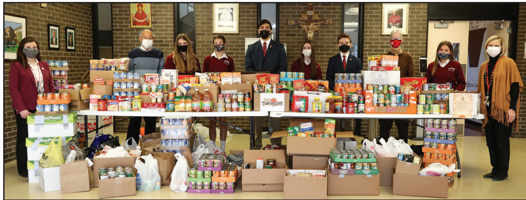
Students, faculty and staff at Holy Redeemer High School in Wilkes-Barre , cognizant of the food insecurity that many in our area face, hosted a Thanksgiving Food Drive to benefit the Saint Vincent de Paul Kitchen in Wilkes-Barre.