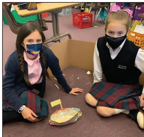
Fourth grade students at La Salle Academy in Jessup designed and built their own Mayflower ship for Thanksgiving.