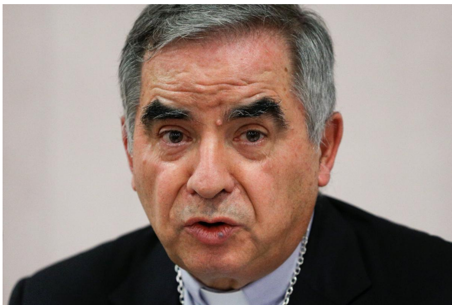
Cardinal Angelo Becciu

The alleged mishandling of millions of dollars of church funds will bring several high-profile individuals to a makeshift Vatican courtroom set up in a multifunction room of the Vatican Museums.