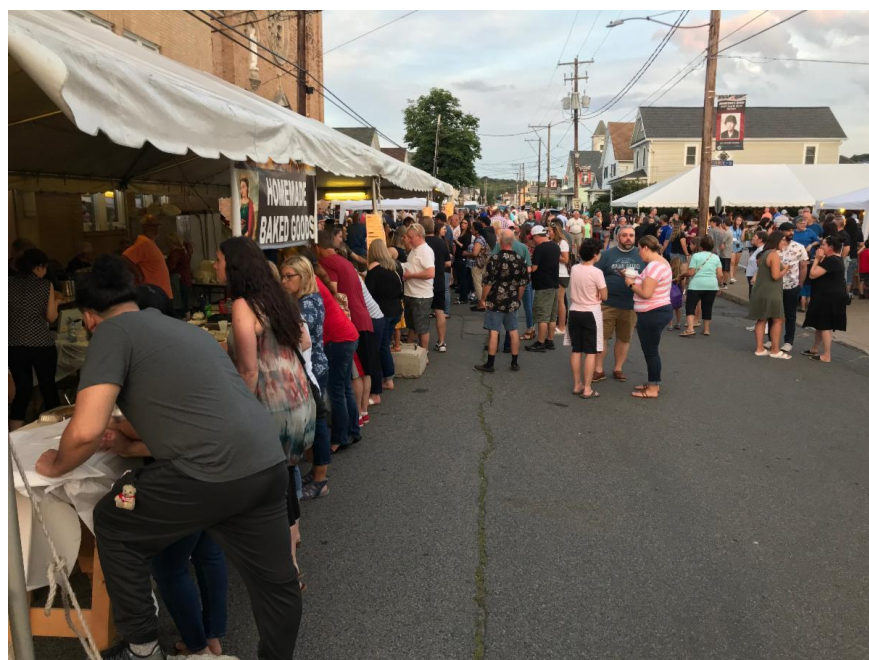
Parish Picnic at Nativity of Our Lord Parish, Duryea, July 10, 2021