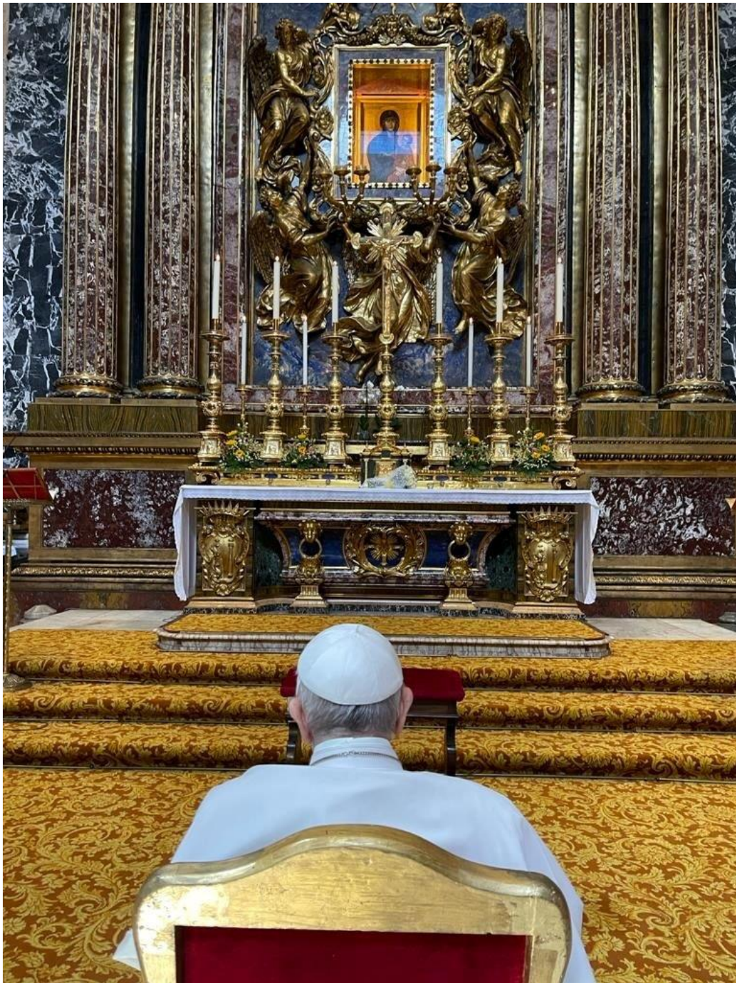
Ten days after undergoing intestinal surgery, Pope Francis was released from Rome's Gemelli hospital, the Vatican confirmed.