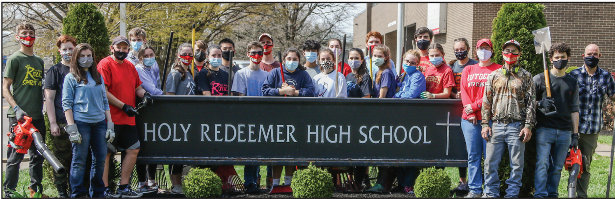
Members of the Student Leadership Council, along with faculty and staff at Holy Redeemer High School in Wilkes-Barre , gathered on a Saturday and cleaned up the school grounds before the school closed for summer break.