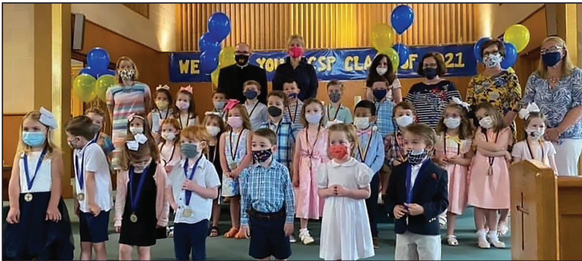
There were smiles all around as the Pre-Kindergarten students at Saint Clare/Saint Paul School in Scranton celebrated at the end of their graduation program.