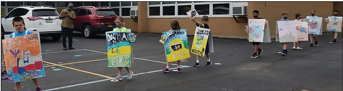
Students made placards of their favorite reading books and marched around Epiphany School in Sayre as they celebrated the end of the year with their annual Book Parade.