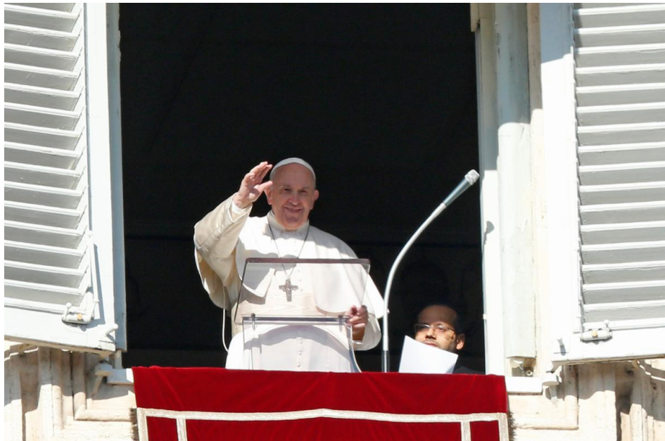
Pope Francis greets the crowd as he leads the Angelus from the window of his studio overlooking Saint Peter's Square at the Vatican Jan. 1, 2020.