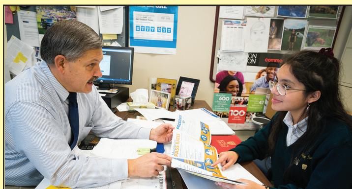
Notre Dame Jr./Sr. High School Grades 7 - 12 60 Spangenburg Avenue in East Stroudsburg • (570) 421-0466 1 p.m. – 3 p.m.