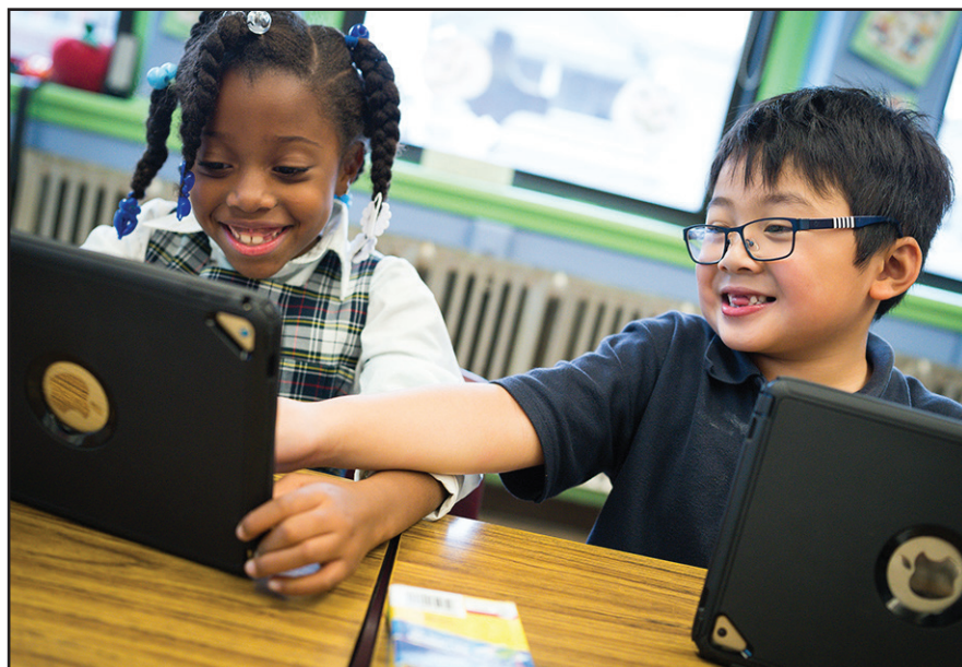
Saint Nicholas/Saint Mary School Grades PK – 8 242 South Washington Street in Wilkes-Barre • (570) 823-8089 1 p.m. – 3 p.m.