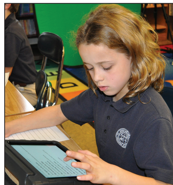
Saint John Neumann Elementary School Grades PK – 5 710 Franklin Street in Williamsport • (570) 326-3738 12 p.m. – 1:30 p.m.