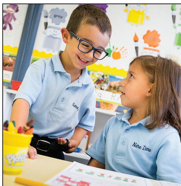
Notre Dame Elementary School Grades PK – 6 • (570) 421-3651 60 Spangenburg Avenue in East Stroudsburg 1 p.m. – 3 p.m.