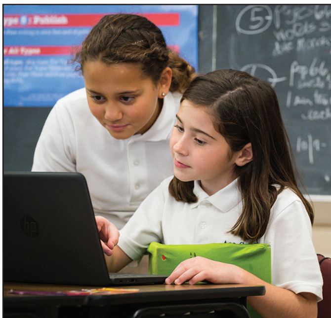
All Saints Academy Grades PK – 8 and Individualized Instruction 1425 Jackson Street in Scranton • (570) 343-8114 1 p.m. – 3 p.m.