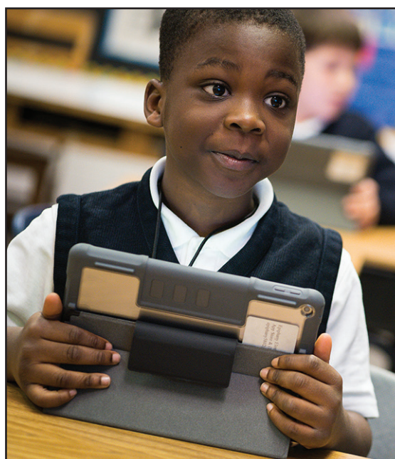
Epiphany School Grades PK – 6 627 Stevenson Street in Sayre • (570) 888-5802 12 p.m. – 2 p.m.