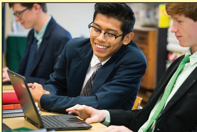
Holy Cross High School Grades 9 – 12 and Individualized Instruction 501 East Drinker Street in Dunmore • (570) 346-7541 Call to schedule a tour