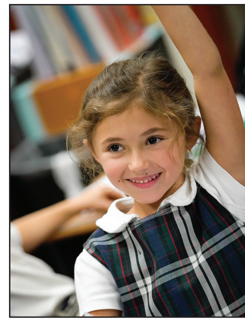
Saint Clare/Saint Paul School Grades PK – 2 2215 North Washington Avenue in Scranton • (570) 343-2790 Grades 3 – 8 1527 Penn Avenue in Scranton (570) 343-7880 — 12 p.m. – 2 p.m.