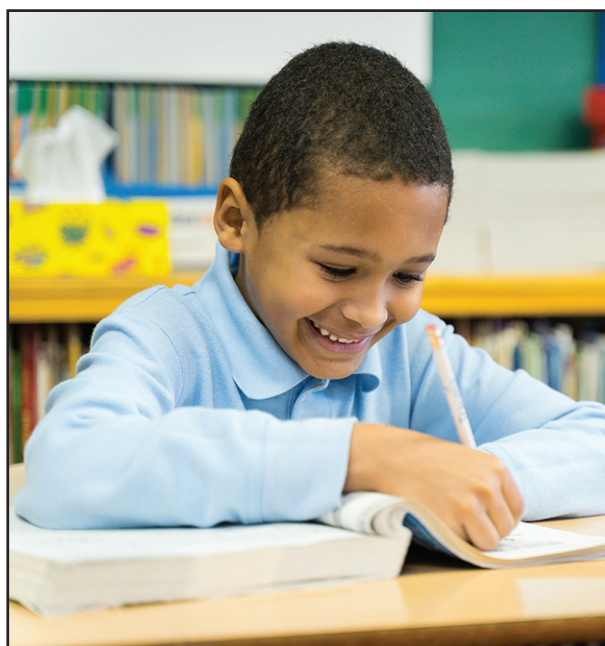
Holy Rosary School Grades PK – 8 125 Stephenson Street in Duryea • (570) 457-2553 12 p.m. – 2 p.m.