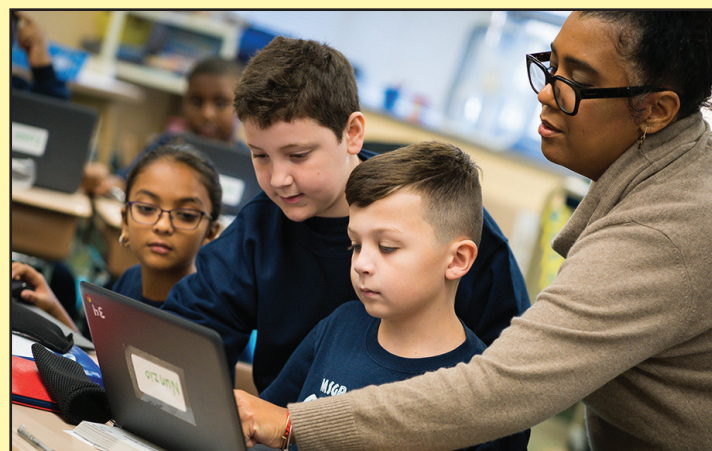
Monsignor McHugh School Grades PK – 8 212 Route 390 in Cresco • (570) 595-7463 11 a.m. – 1 p.m.