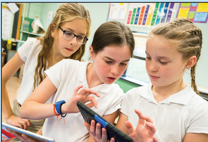
Saint Agnes School Grades PK – 6 102 Third Avenue in Towanda (570) 265-6803 10 a.m. – 2 p.m.