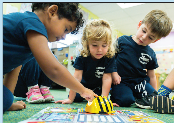
Wyoming Area Catholic School Grades PK – 8 1690 Wyoming Avenue in Exeter (570) 654-7982 12 p.m. – 2 p.m.