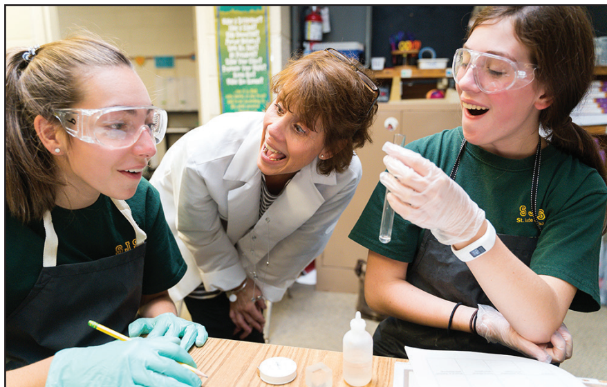
Saint Jude School Grades PK – 8 422 South Mountain Boulevard in Mountain Top • (570) 474-5803 12 p.m. – 2 p.m.