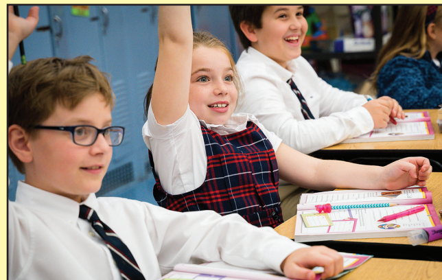
Our Lady of Peace School Grades PK – 8 410 North Abington Road in Clarks Green • (570) 587-4152 1 p.m. – 3 p.m.