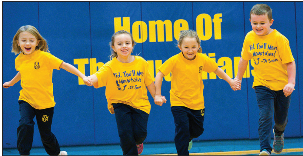
Good Shepherd Academy Grades PK – 8 and Individualized Instruction 316 North Maple Street in Kingston • (570) 718-4724 1:30 p.m. – 3 p.m.