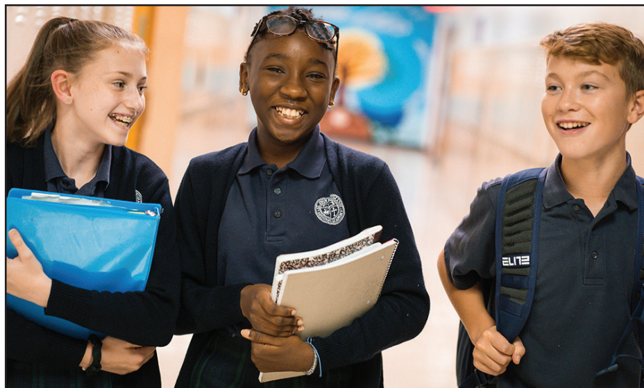
Saint John Neumann Jr./Sr. High School Grades 6 – 12 901 Penn Street in Williamsport • (570) 323-9953 12 p.m. – 1:30 p.m.