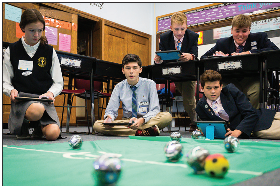
Saint Mary of Mount Carmel School Grades PK – 8 325 Chestnut Street in Dunmore • (570) 346-4429 12 p.m. – 3 p.m.