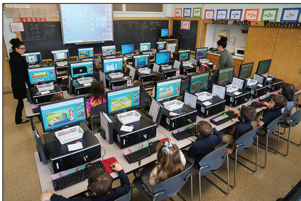
Good Shepherd Academy in Kingston