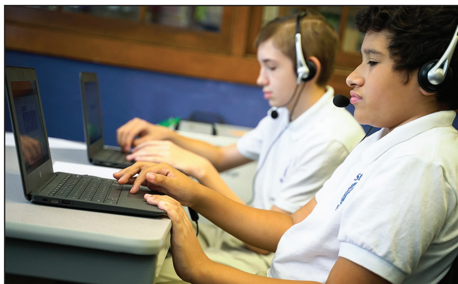
Saint Clare/Saint Paul School in Scranton