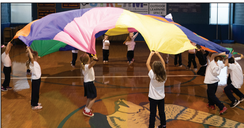
Our Lady of Peace School in Clarks Green