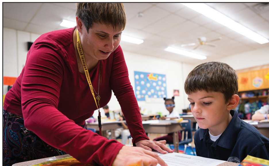
Saint John Neumann Elementary School in Williamsport