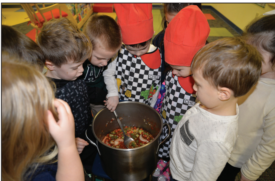
The Pre-Kindergarten students at Holy Rosary School in Duryea made homemade vegetable soup to celebrate the letter "V."