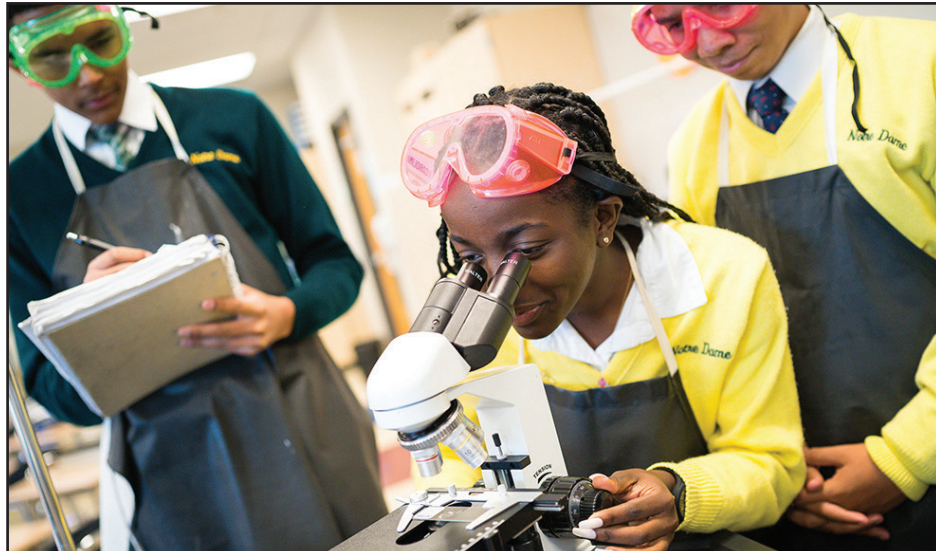
Notre Dame Jr./Sr. High School in East Stroudsburg