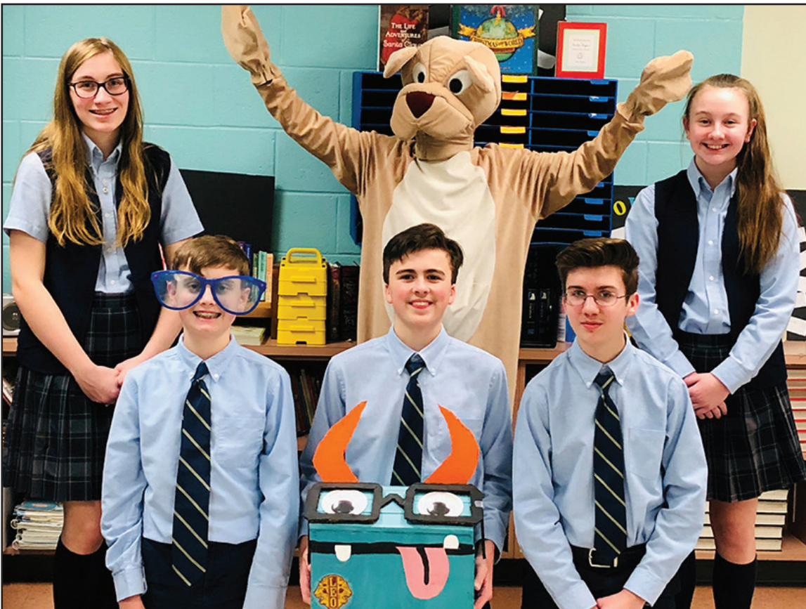
Wyoming Area Catholic School in Exeter and Pittston Area PDG Leo's Club have joined forces to fight blindness by asking for donations of used prescription glasses. Glass Glo, the collection container that loves to "eat" glasses, is located in the school's lobby so people can easily deposit their prescription glasses or sunglasses.