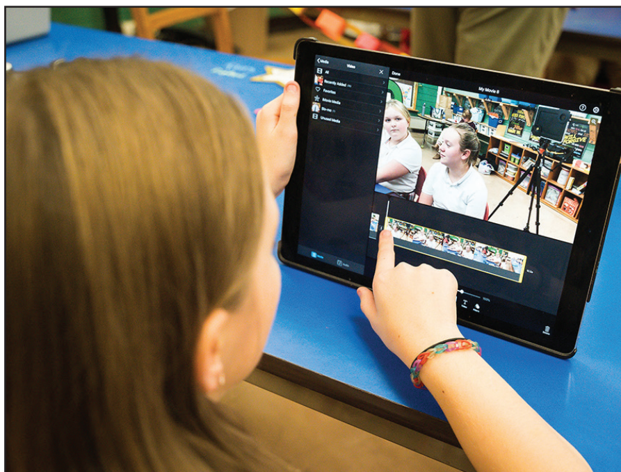
Saint Agnes School in Towanda