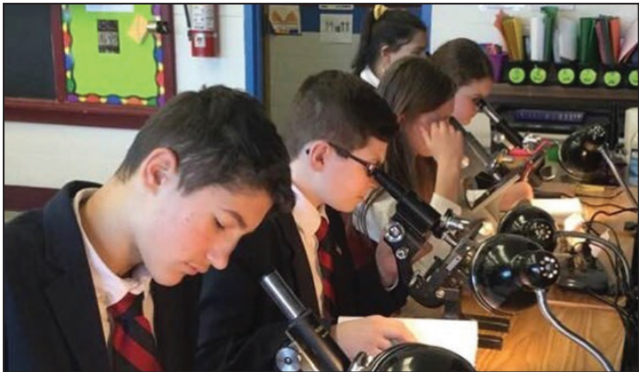
Using microscopes, sixth grade students at La Salle Academy in Jessup recreate Robert Hooke's investigation on discovering and naming cells.