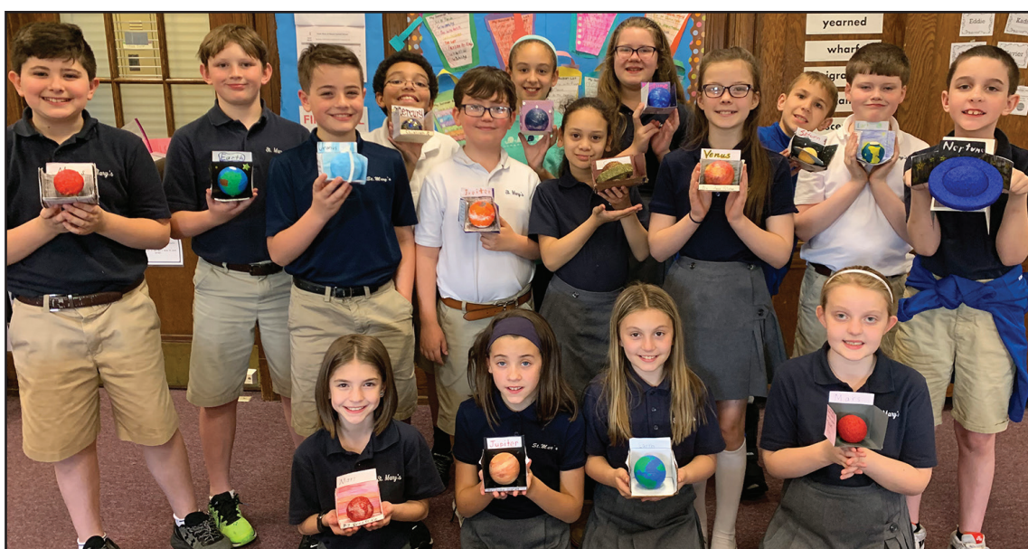
The fourth grade class at Saint Mary of Mount Carmel School in Dunmore finished the school year becoming both researchers and artists. As part of a lesson on the solar system, each student did an in-depth research project about the sun and planets and also had to create a small model of the celestial body they studied.