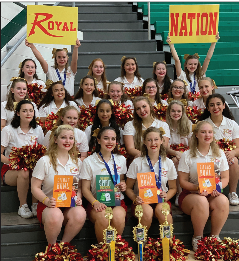
The Cheer Squad at Holy Redeemer High School in Wilkes-Barre proudly show off their trophies after recently placing first at the Game Day Division Cheer Camp.