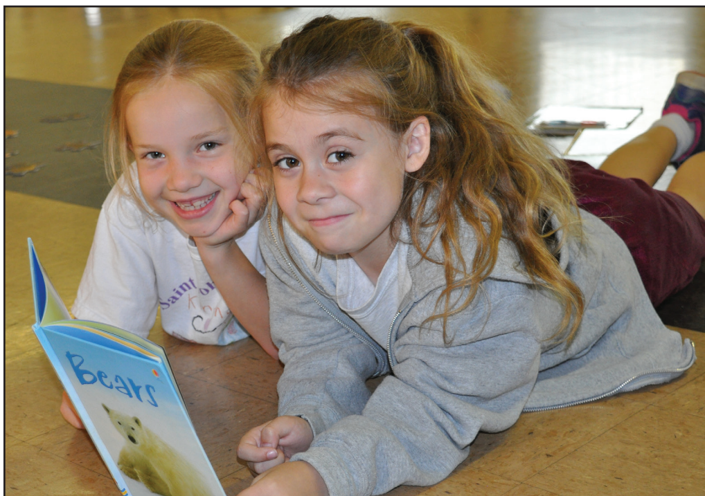
Students at Saint John Neumann Elementary School in Williamsport love to read and know it’s even more fun when you read with a friend!