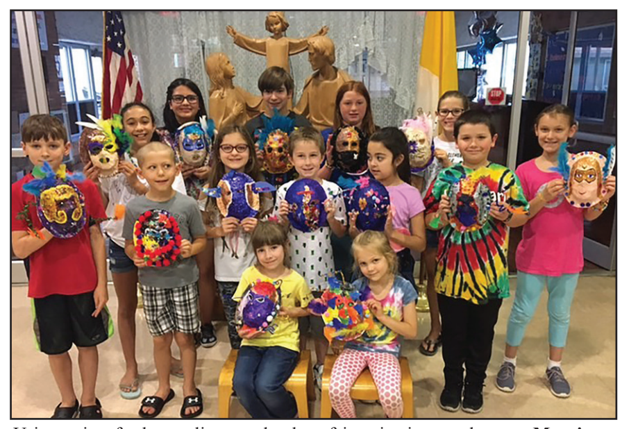
Using paint, feathers, glitter, and a lot of imagination, students at Monsignor McHugh School in Cresco created these unique masks at the school's annual Summer Art Camp.