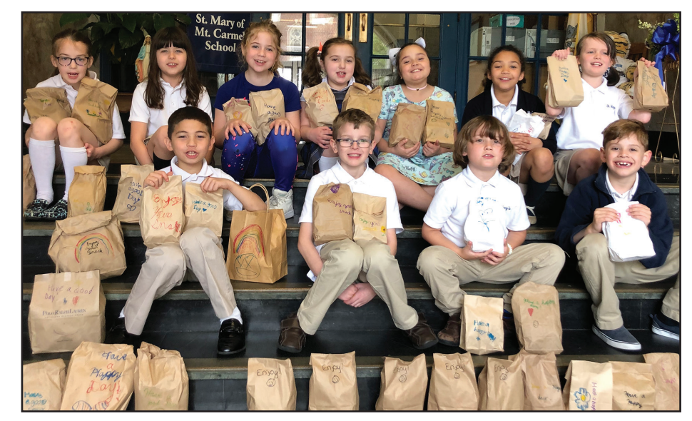
As part of their preparation for their First Holy Communion, the second grade class at Saint Mary of Mount Carmel School in Dunmore collected 157 take-home bags for Saint Francis of Assisi Soup Kitchen in Scranton. They added a friendly note and drawing to each bag for a very personal touch.