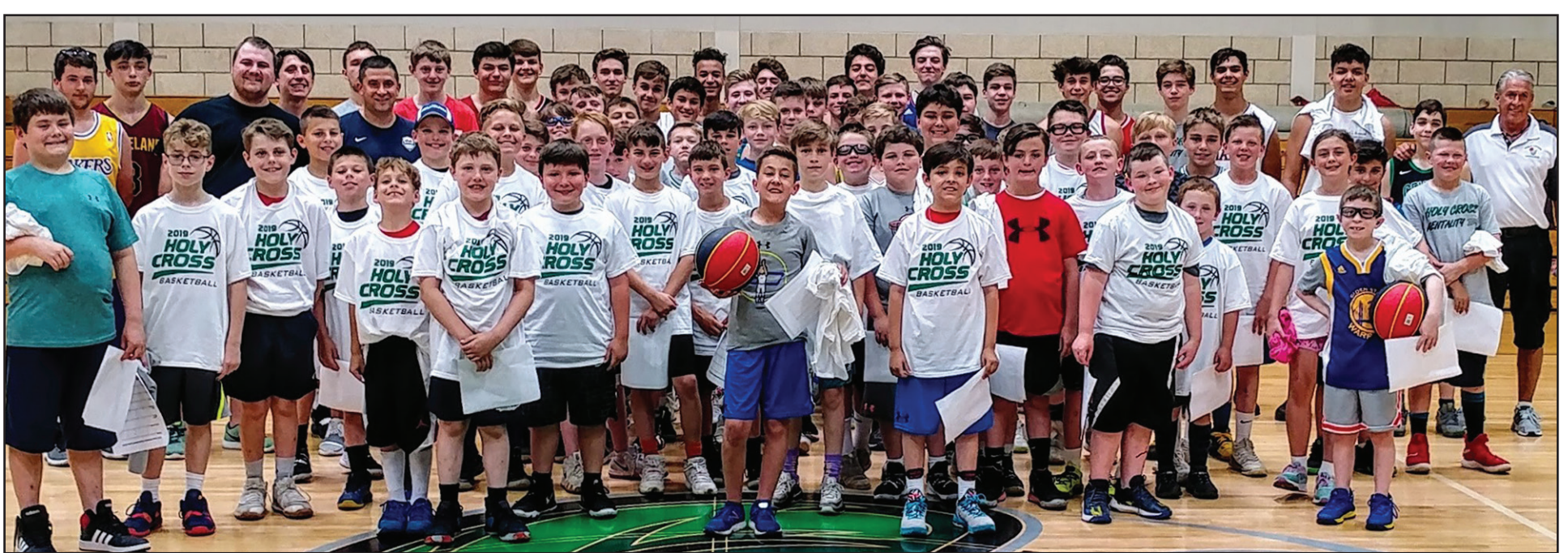
The boys' basketball players and coaching staff from Holy Cross High School in Dunmore recently invited students entering fourth through ninth grade to a summer camp at the school so they could review player fundamentals, preparing for their time as future Crusader basketball superstars.

The Diocese of Scranton is committed to educating our students in an environment that is academically excellent and facilitates the development of moral judgment and Christian decision-making. We are proud to share the following successes of our students in the classroom and in their service to others. Each day, our schools are fulfilling their mission of preparing today's youth and young adults to become tomorrow's faith-filled leaders.