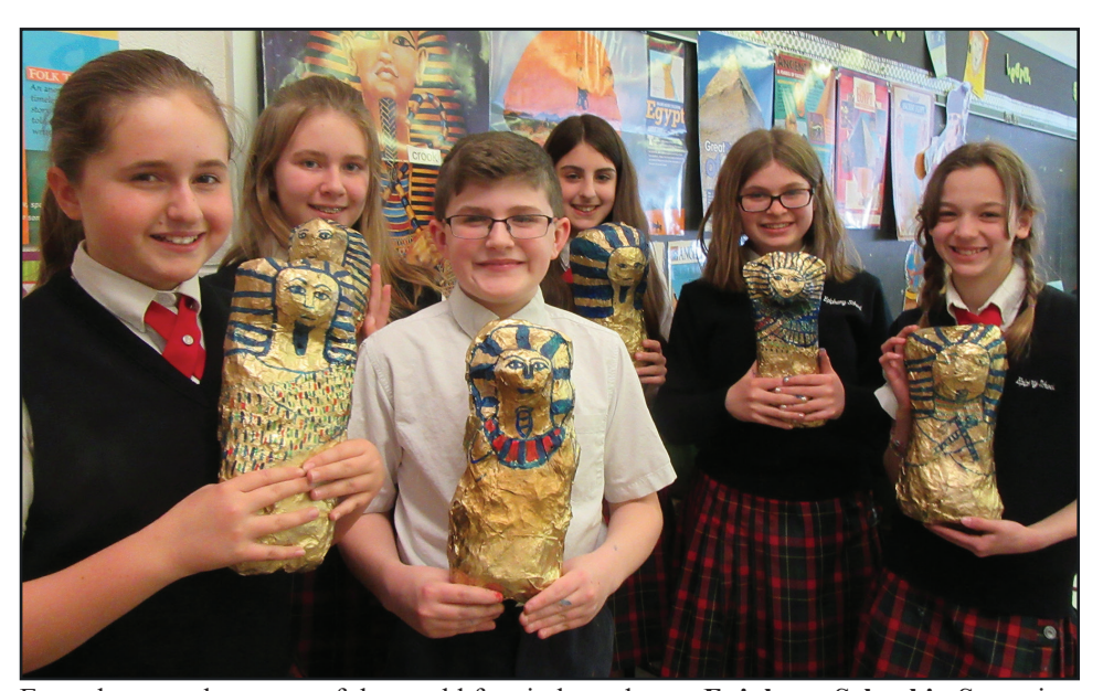
Egypt became the center of the world for sixth graders at Epiphany School in Sayre just before summer vacation. Students studied Ancient Egypt in their history class that included lessons about mummies, which they then replicated using paper mache for an art class project.