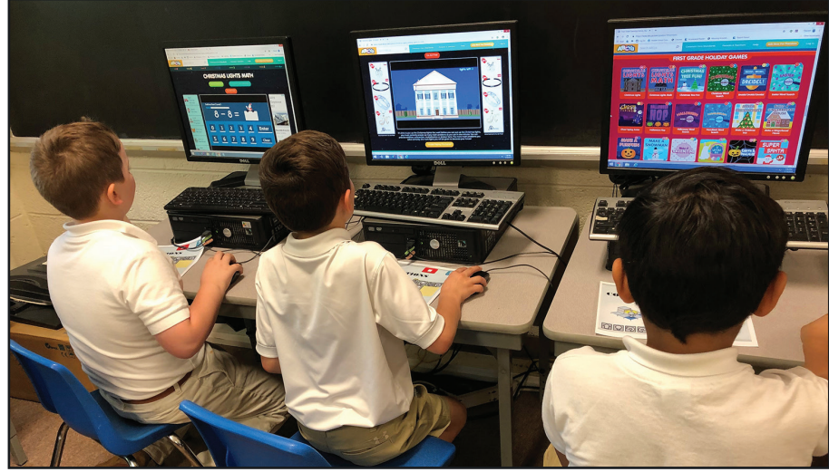
The first grade students at Saint Clare/Saint Paul School in Scranton end the school year by focusing on coding activities. Coding allows students to tell the computer what they want it to do. Shown are some of the students working on a program that allows them to add Christmas lights to a home.