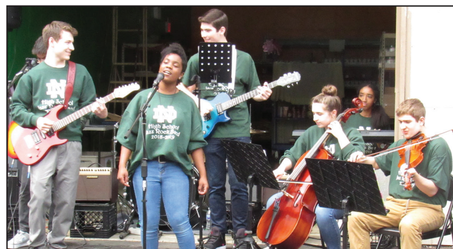
The Jazz and Rock Band from Notre Dame Jr./Sr. High School in East Stroudsburg provided the entertainment at the Pleasant Valley Ecumenical Network's Community Service Fair. The band members also made a generous donation to PVEN's food pantry.