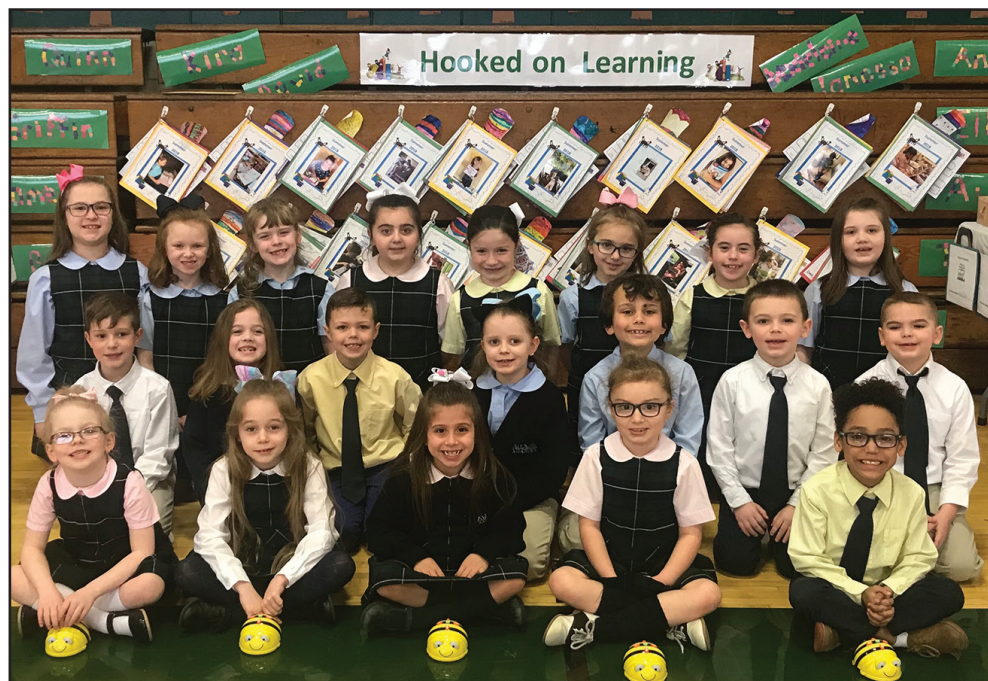
The first grade students at All Saints Academy in Scranton sit with their BeeBots as they prepare to welcome families to “Night at the Museum”... an evening STREAM Fair, Educational Fair, Science Fair, and Art Exhibit.

The Diocese of Scranton is committed to educating our students in an environment that is academically excellent and facilitates the development of moral judgment and Christian decision-making. We are proud to share the following successes of our students in the classroom and in their service to others. Each day, our schools are fulfilling their mission of preparing today's youth and young adults to become tomorrow's faith-filled leaders.