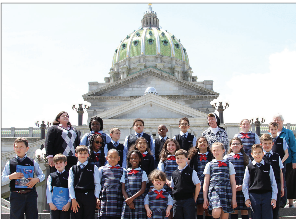
The fourth grade class from Notre Dame Elementary School in East Stroudsburg had a wonderful day touring the Pennsylvania State Capitol Building during their spring trip to Harrisburg.