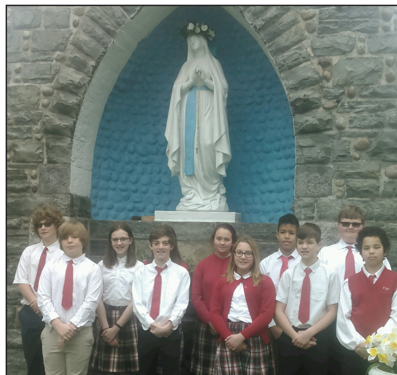
The sixth grade class at Saint Agnes School in Towanda start the month by honoring the Blessed Mother with their annual May Crowning celebration.