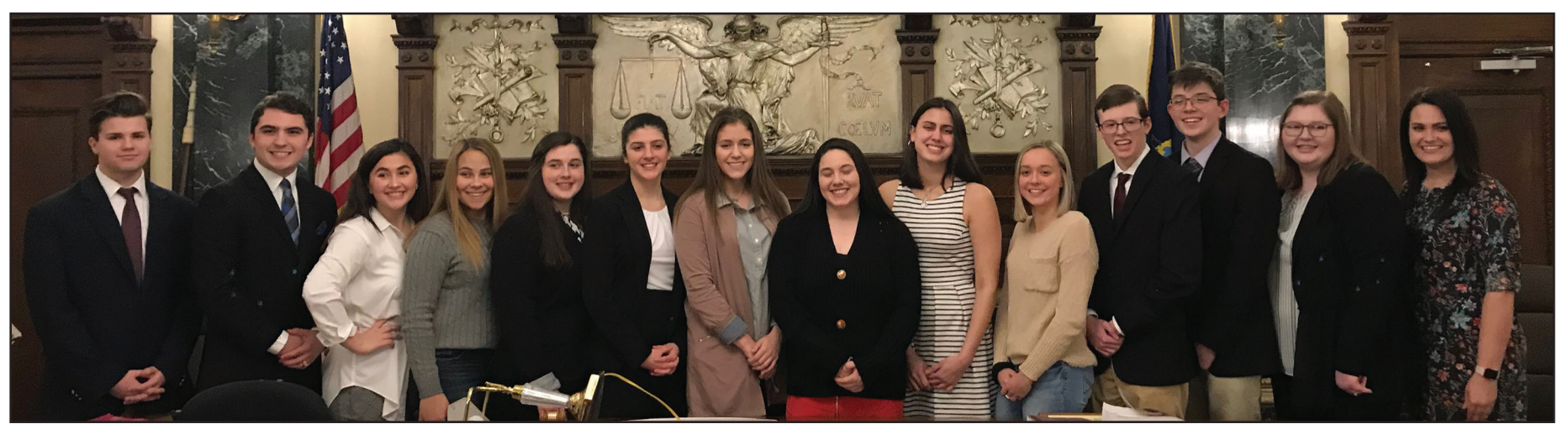
The Mock Trial team from Holy Cross High School in Dunmore recently outscored the team from Scranton Preparatory School, claiming the 2019 Mock Trial District Championship for the second year in a row.