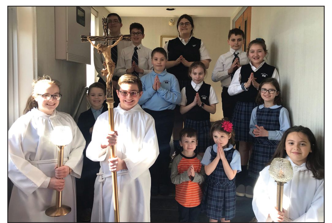
Students at Holy Rosary School in Duryea prepare to participate in a prayer service in which an Alleluia banner is symbolically put away during the Lenten season. The "Bury the Alleluia" ceremony is a school tradition as students and faculty enter the season of fasting and praying.