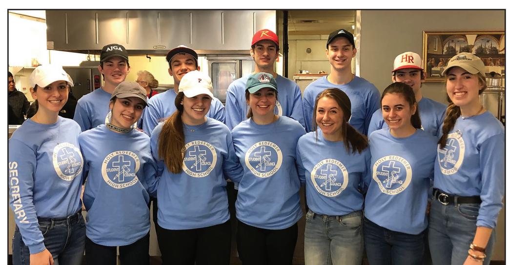
Members of the Student Leadership team at Holy Redeemer High School in Wilkes-Barre spent a day of service at the Saint Vincent de Paul Soup Kitchen in Wilkes-Barre.