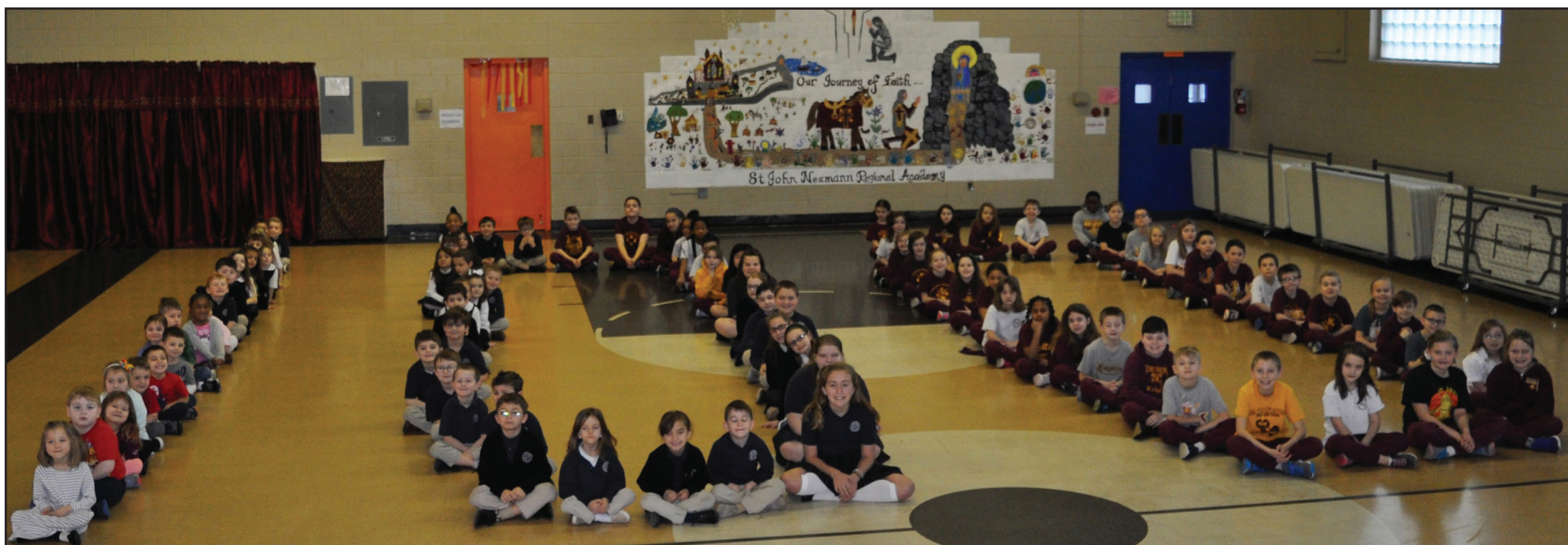
Students from Saint John Neumann Elementary School in Williamsport form the number “100” in celebration of their 100th day of school.