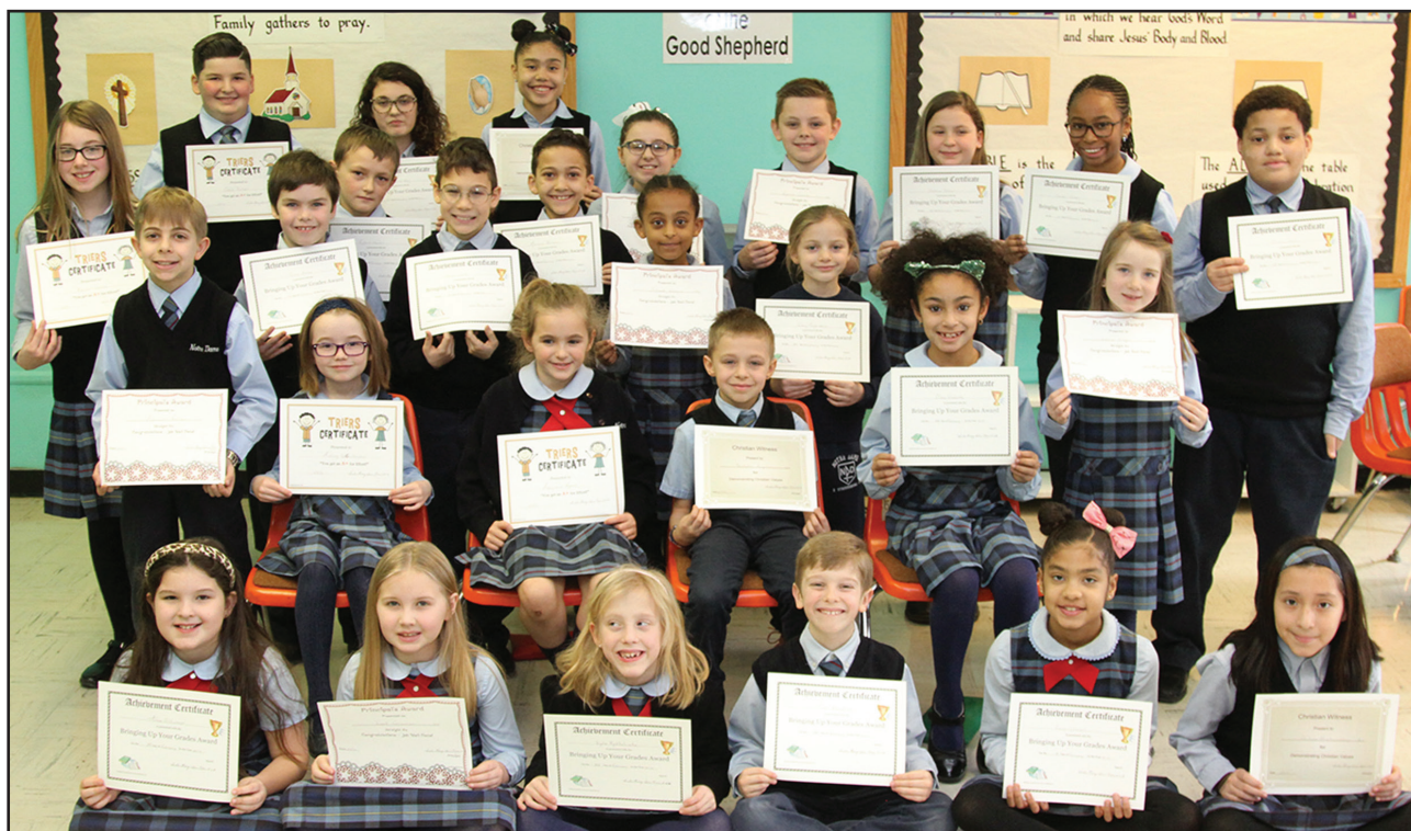
Students at Notre Dame Elementary School in East Stroudsburg proudly display their 2nd quarter academic achievement awards.