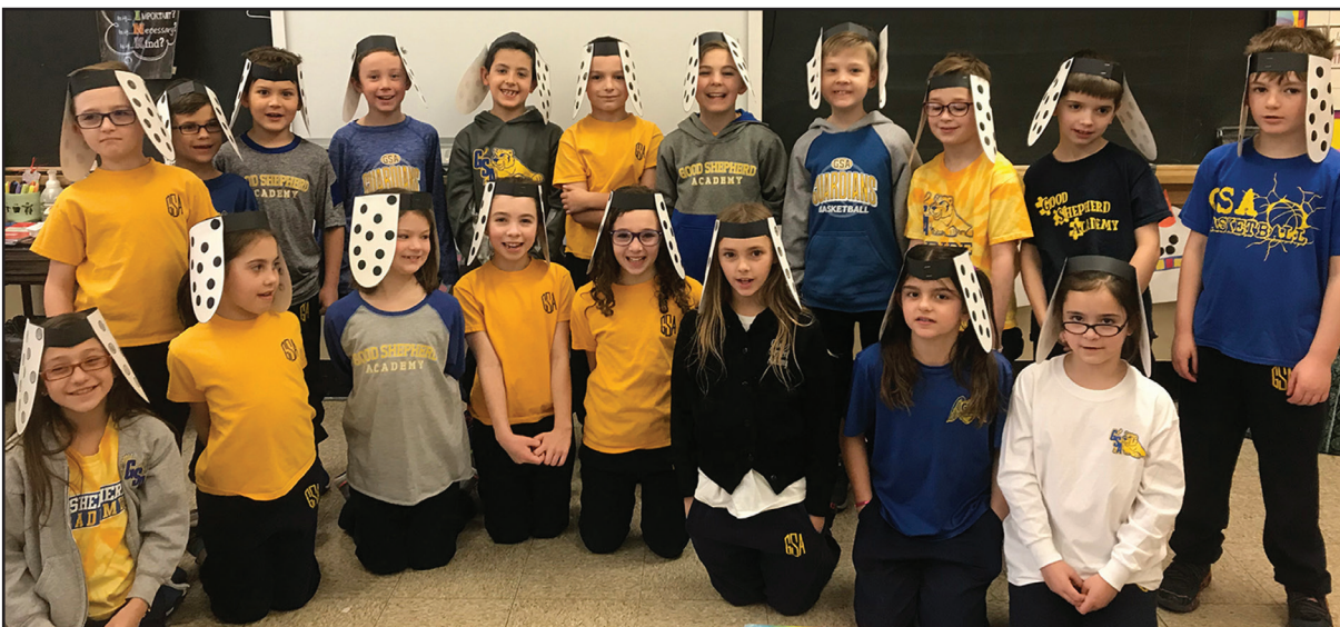
The 2nd graders at Good Shepherd Academy in Kingston had a "dog-gone" good day celebrating their 102nd school day by making Dalmatian ears and enjoying a little break watching "102 Dalmatians."