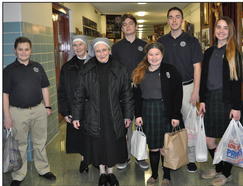
Members of the Leo Club at Saint John Neumann High School in Williamsport help carry the toiletry and non-perishable food items they collected during Catholic Schools Week for the Little Sisters of the Poor.