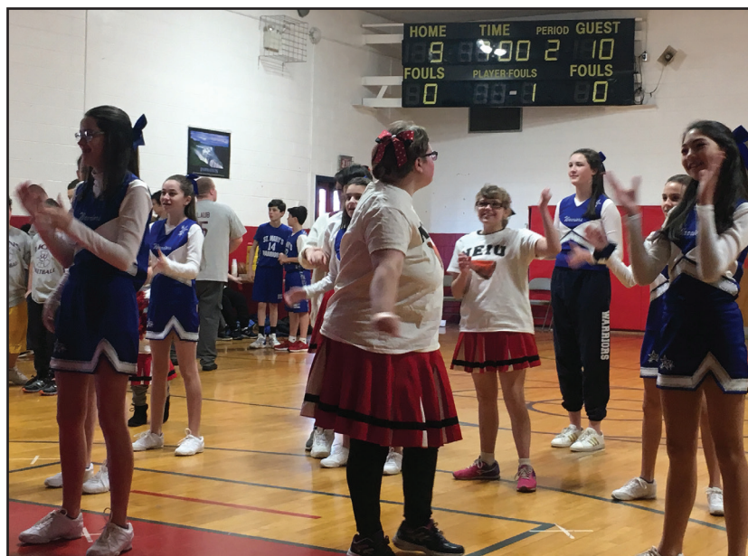
During a recent basketball game between the two schools, cheerleaders from Saint Mary of Mount Carmel School in Dunmore perform their routines alongside cheerleaders from the Jefferson Center, a special education school also located in Dunmore.