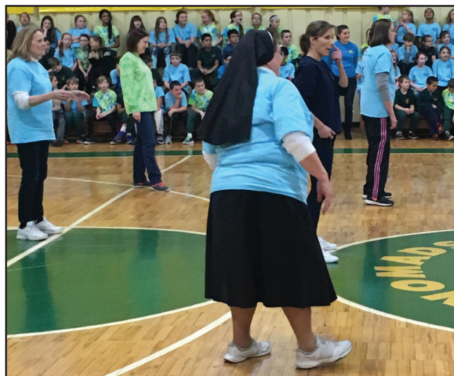
Students cheer on the players at the annual "Faculty vs. 8th Grade" volleyball game during the Catholic Schools Week celebration at Saint Jude School in Mountain Top .