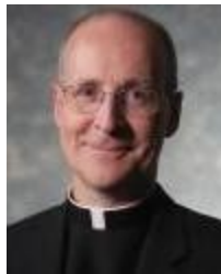
Fr. James Martin Keynote

The Gospel tells us constantly to run the risk of a face-to-face encounter with others, with their physical presence which challenges us, with their pain and their pleas, with their joy which infects us in our close and continuous interaction. True faith in the incarnate Son of God is inseparable from self-giving, from service, from reconciliation with others. The Son of God, by becoming flesh, summons us to the revolution of tenderness. (EG #88)