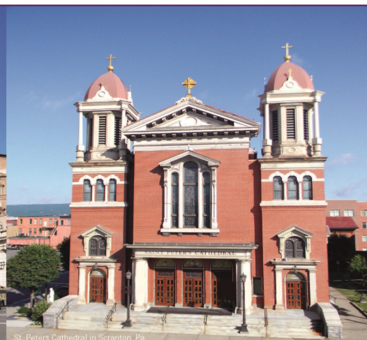
St. Peter's Cathedral in Scranton, Pa.