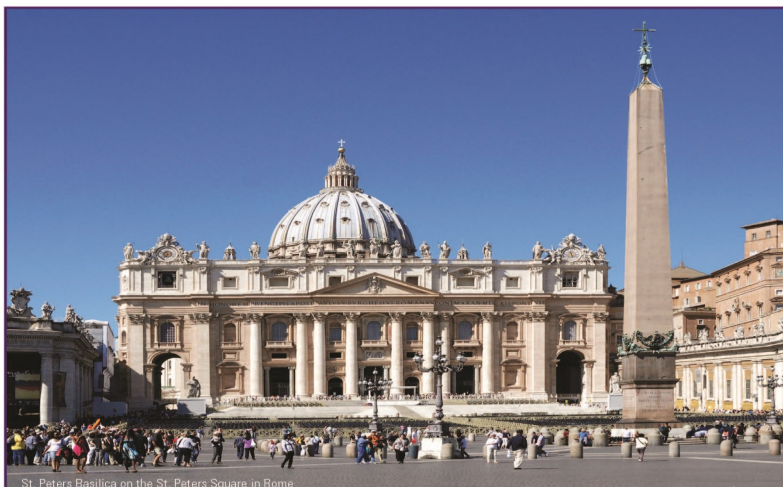
St. Peter's Basilica on the St. Peter's Square in Rome