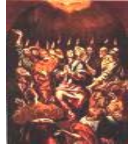
“The effect of Confirmation is a special outpouring of the Holy Spirit like that of Pentecost.”

the link between the confirmed and the Church in her apostolic dimension is made manifest. When a priest confers this sacrament, as ordinarily happens in the East and in special cases in the West, the link with the bishop and with the Church is expressed by the priest who is the collaborator of the bishop and by the Sacred Chrism, consecrated by the bishop himself.